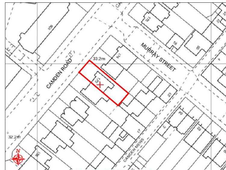
OS Map 1:1250