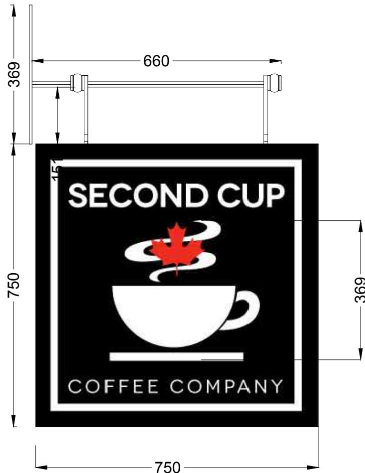
SIGN C - Signage contractor to supply and install new externally illuminated, 750 x 750 x 20mm projection sign. Timber panel with lettering and logo vinylated onto panel. Brackets to be constructed from stainless steel. Fixings TBC by nominated signage contractor on site.