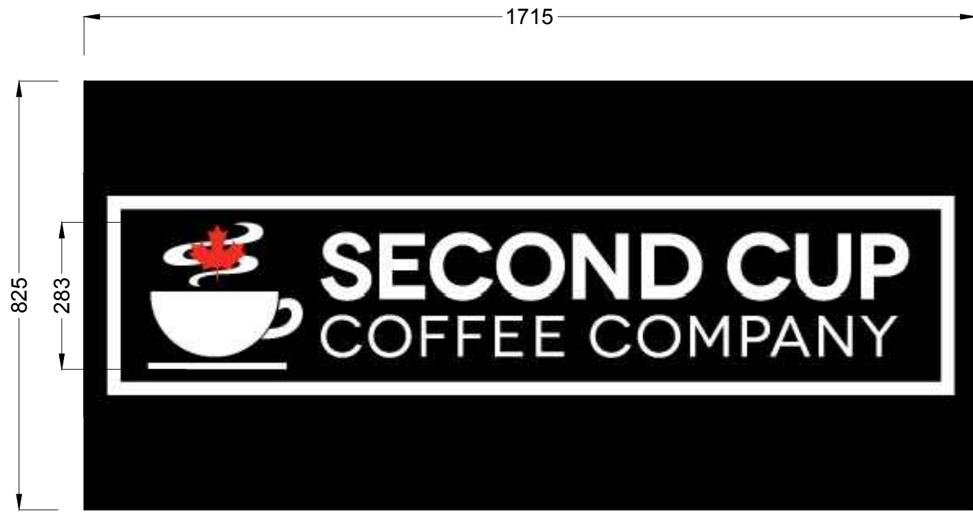
SIGN A - Signage contractor to supply and install new non illuminated single sided folded aluminium fascia, to be powder coated to match RAL 9004 Signal Black with 10mm push through acrylic lettering and logo to match RAL 9003 Signal White, attached to existing structural element as per existing signage.