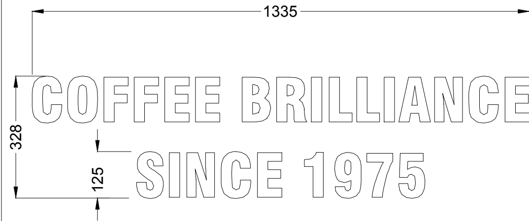
SIGN B - Signage contractor to supply & install new internally applied 125mm high, individually cut white vinyl text applied to glass panel. Font to be Swiss BdBnOul BT.