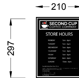
SIGN E - Signage contractor to supply & install new internally applied A4 'Second Cup' opening times vinyl.