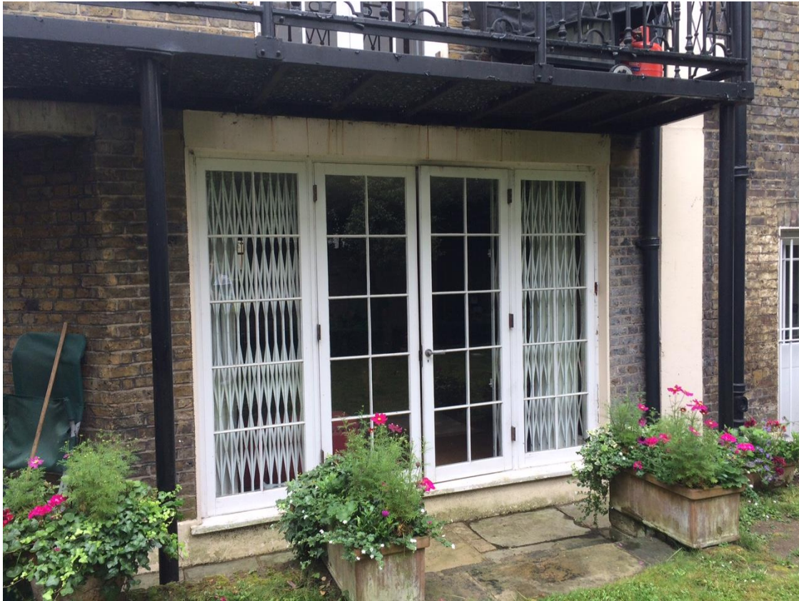
2. Detail of existing timber doors to the rear at lower ground floor level