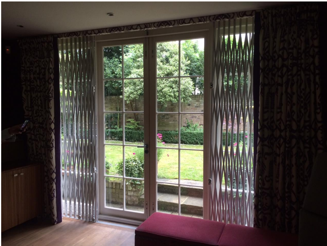
3. Detail of existing timber doors to the rear at lower ground floor level from the inside