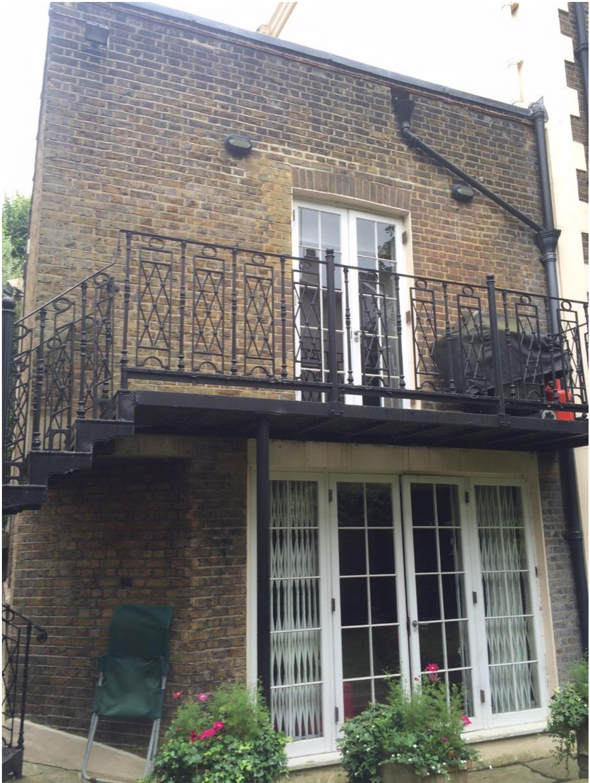
1. Rear elevation of modern side extension to 14 Prince Albert Road