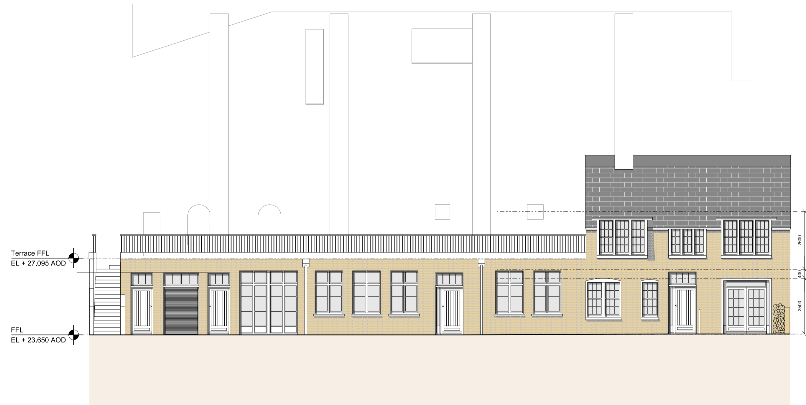
02 Flank Aldwych Elevation Y-Y 1:100