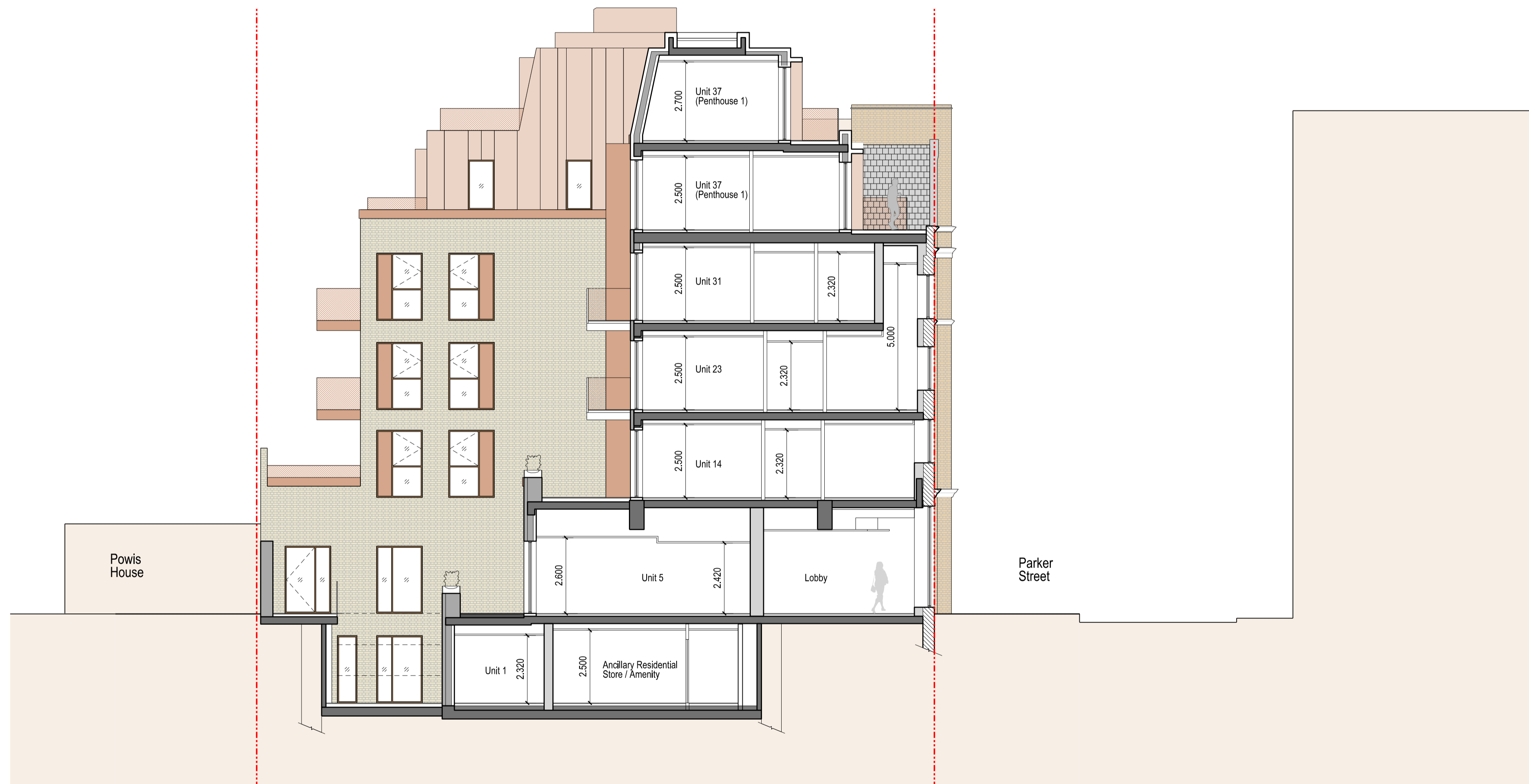
01 Section Elevation C-C 1:100

Disclaimer Do not scale from this drawing. Check all dimensions on site before fabrication or setting out. This document is copyright and may not be reproduced without permission of the owner.