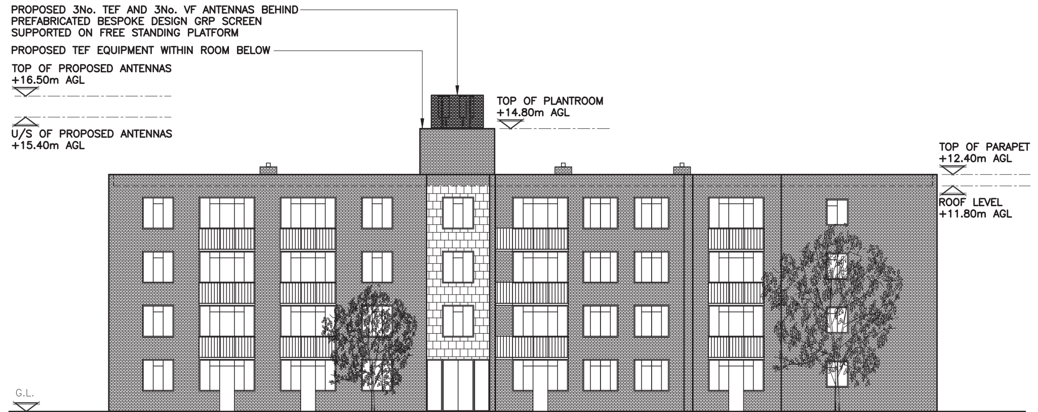
PROPOSED NORTH WEST ELEVATION (1:200)