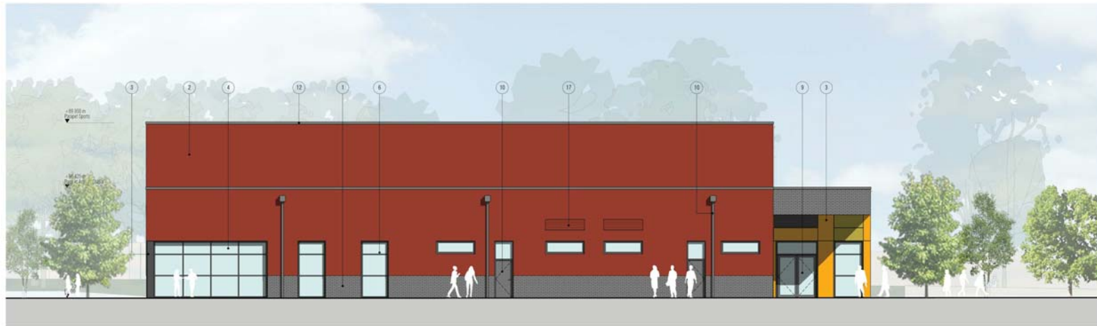
2 WEST ELEVATION 1/200

Note: Boxes Are Positioned On The South Elevation To Allow The Sun To Fall On Each Box For Part Of The Day