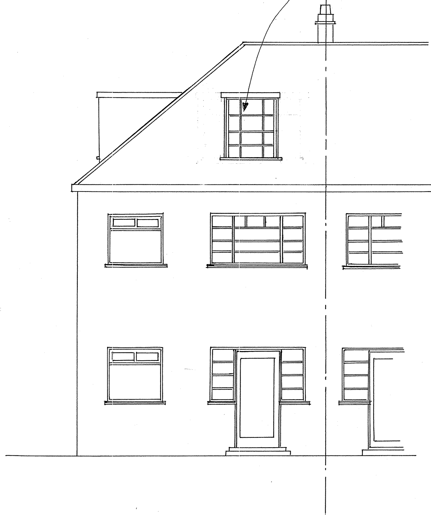
PROPOSED REAR ELEVATION 1:50