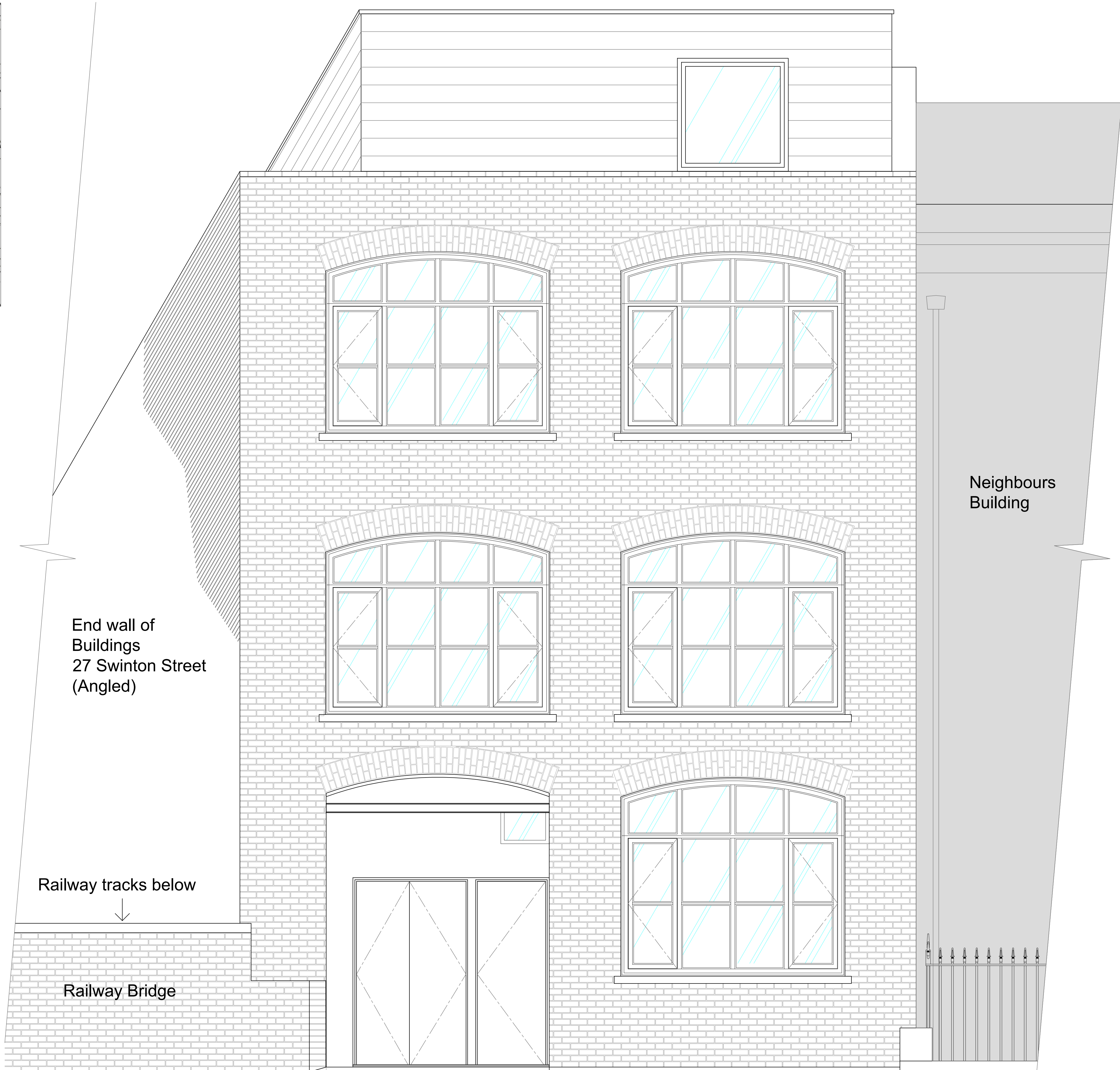
Existing front of building Scale: 1/25