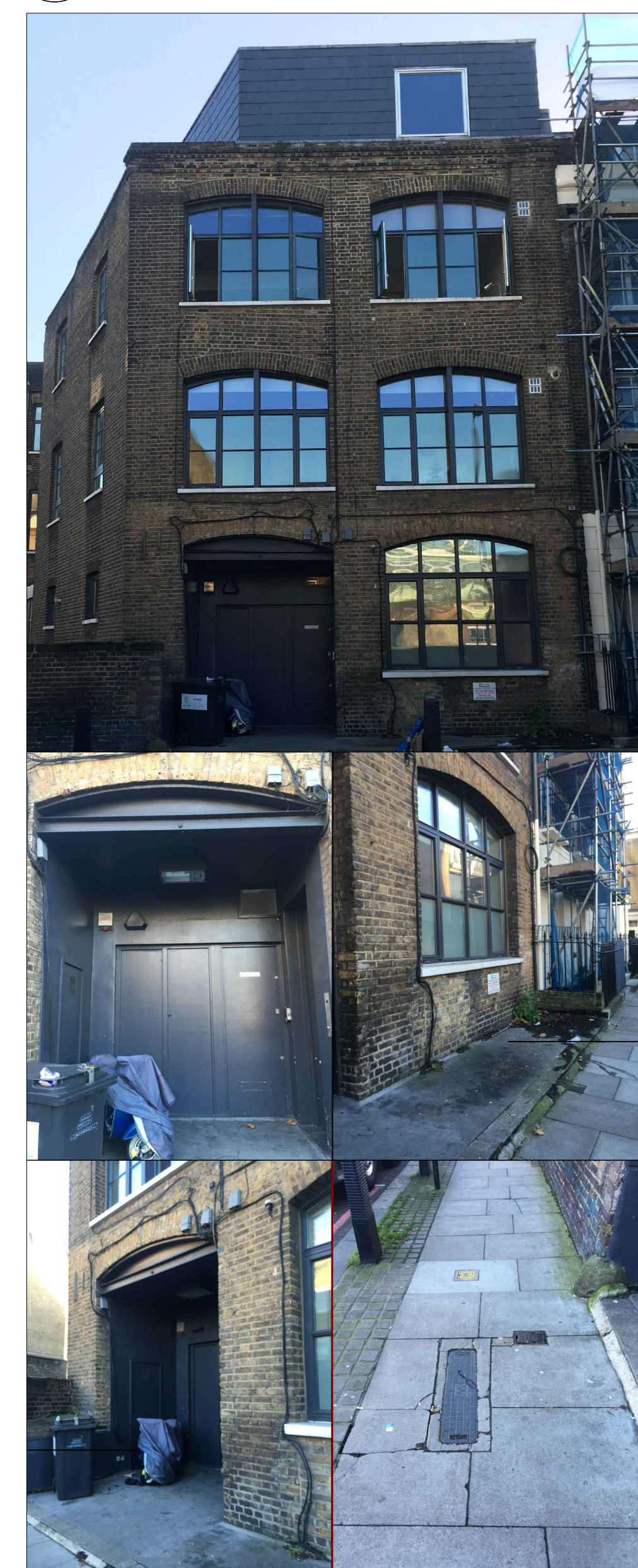
Existing Front of Building Photos