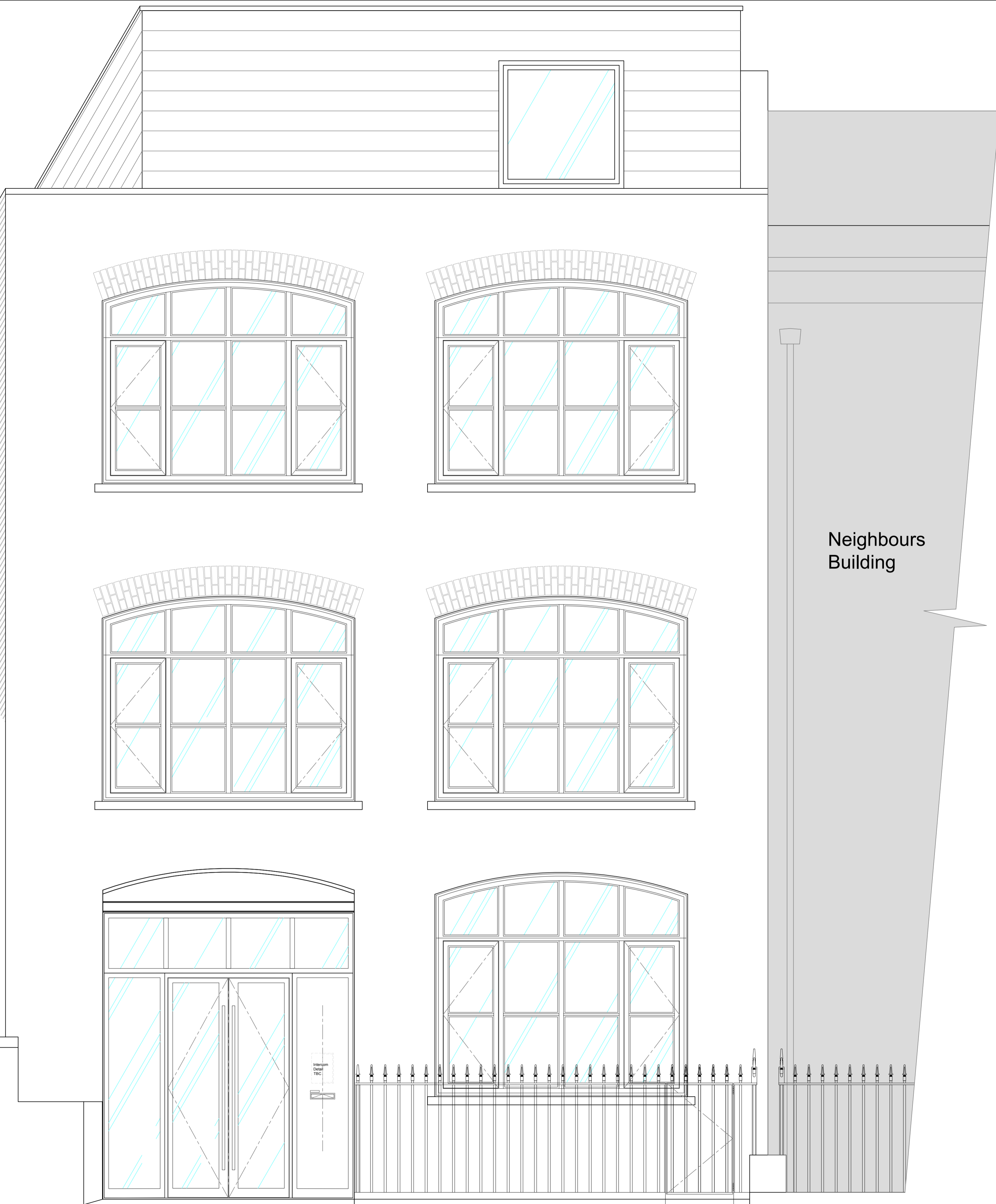
Proposed front of building Scale: 1/25