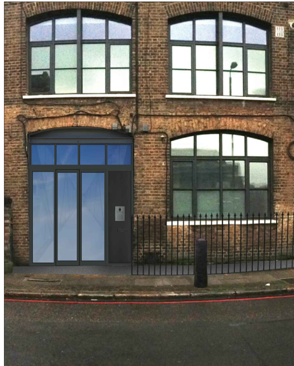
Proposed front of building Reference Only

End wall of Buildings 27 Swinton Street (Angled)