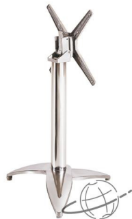
3no. Speedo flip-top table base H 730mm