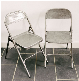
6no. Vintage cinema chair L 45cm x W 65cm x H 80cm