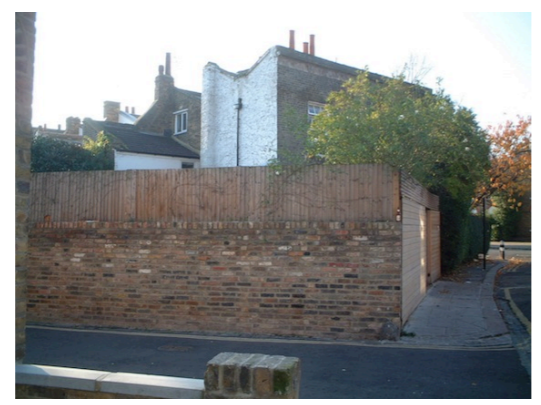
View from corner Clarence Way & Harmood Grove