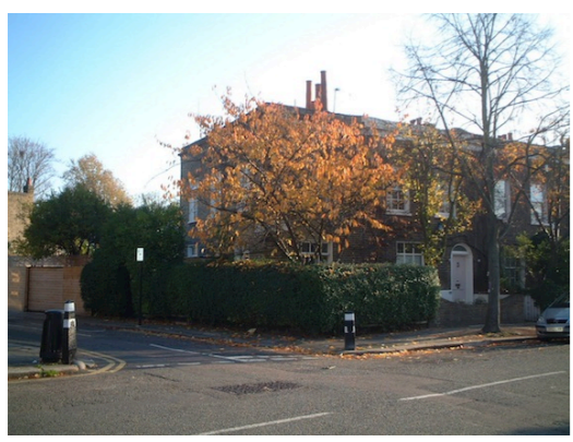
View from Harmood St / Clarence Way corner

Reproduced from the Ordnance Survey Map with permission of the Controller of the Stationery Office Crown Copyright reserved Licence No. AR 187240