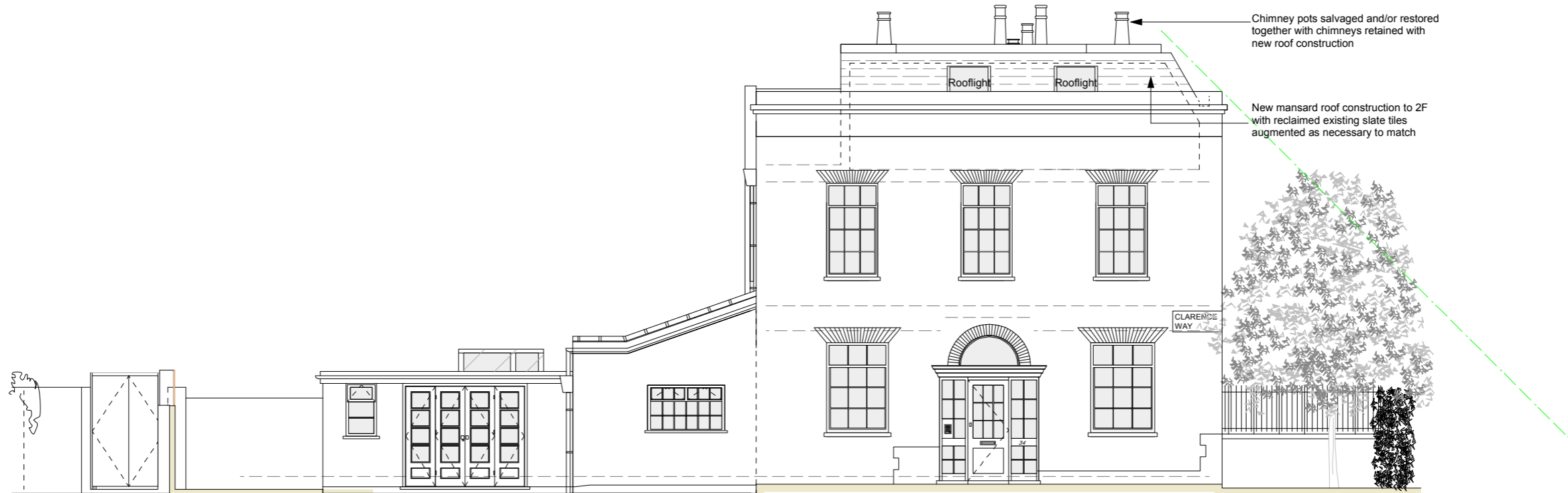
North Elevation : Proposed Scale 1:100