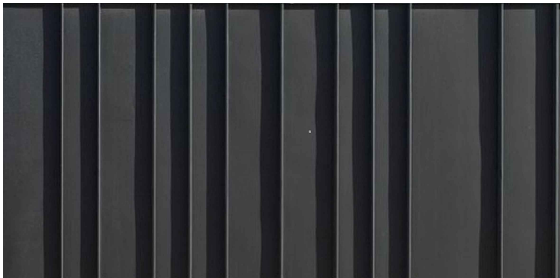
○ Proposed Finish - Corrugated Metal Facade Panels