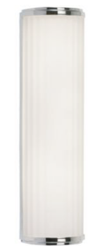
FIRED EARTH GIULIANA