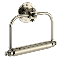
THOMAS CRAPPER TOILET ROLL HOLDER