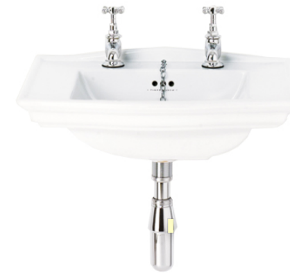
FIRED EARTH MANHATTAN SINK