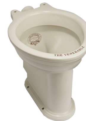
THOMAS CRAPPER TOLIET