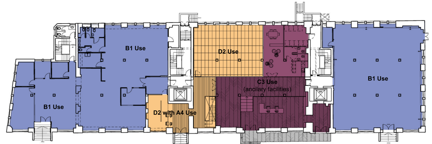
GROUND FLOOR LAYOUT - AS APPROVED (2014/6628/P) USE CLASS KEY PLAN