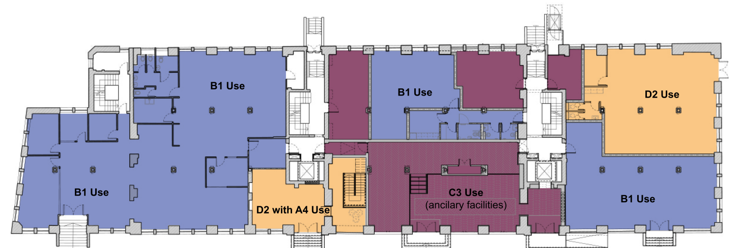
GROUND FLOOR LAYOUT - AS PROPOSED USE CLASS KEY PLAN