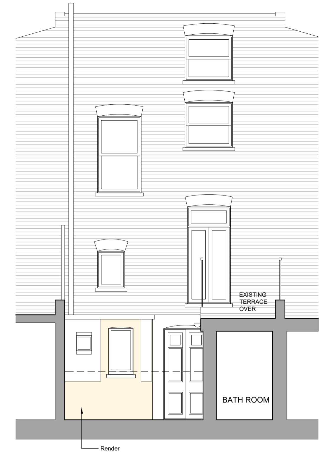
EXISTING REAR ELEVATION 1:50