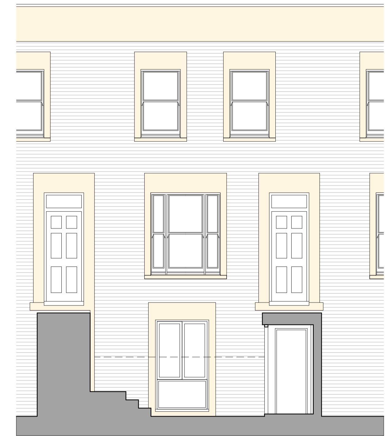
EXISTING FRONT ELEVATION 1:50