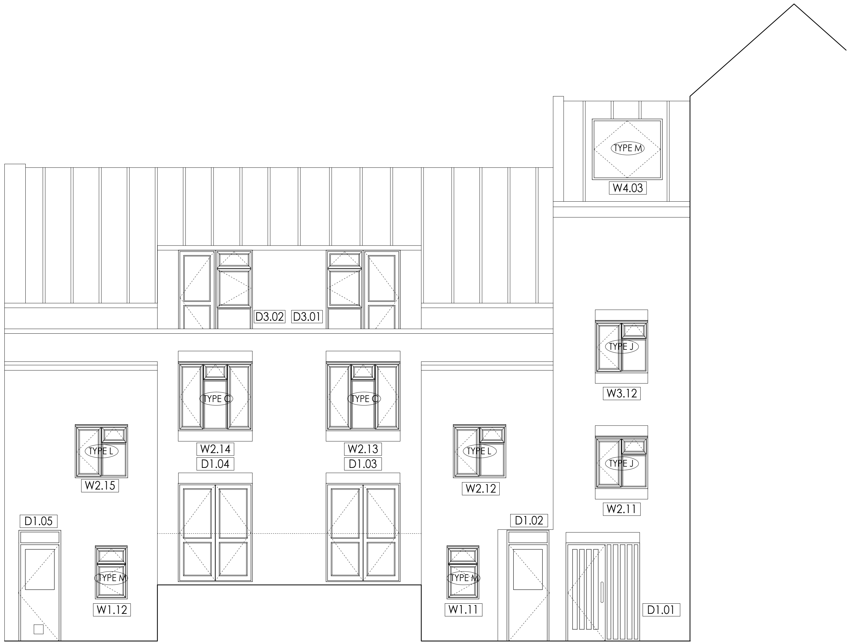
PROPOSED ELEVATION D SCALE 1:50 @ A1