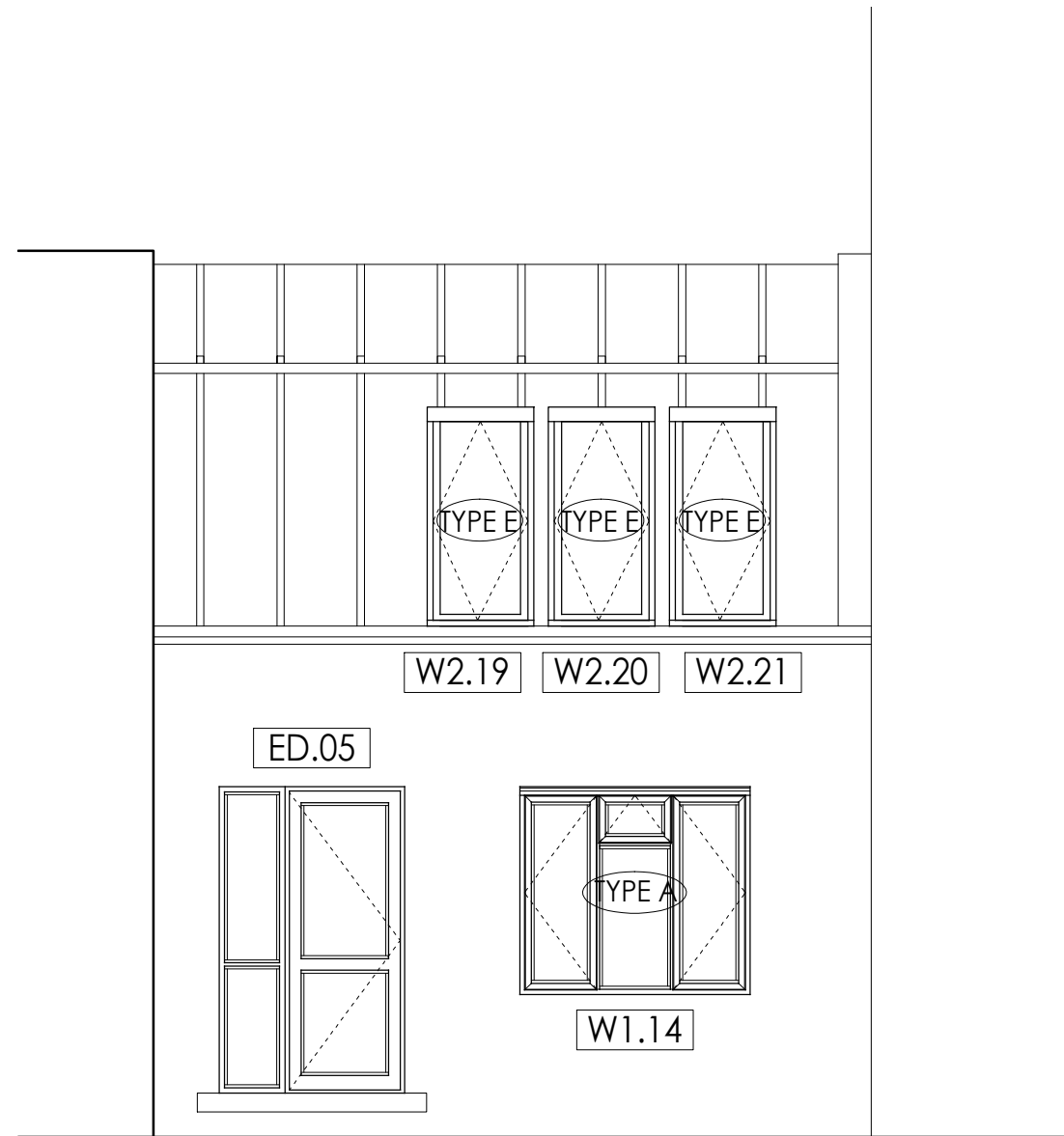
PROPOSED ELEVATION E SCALE 1:50 @ A1