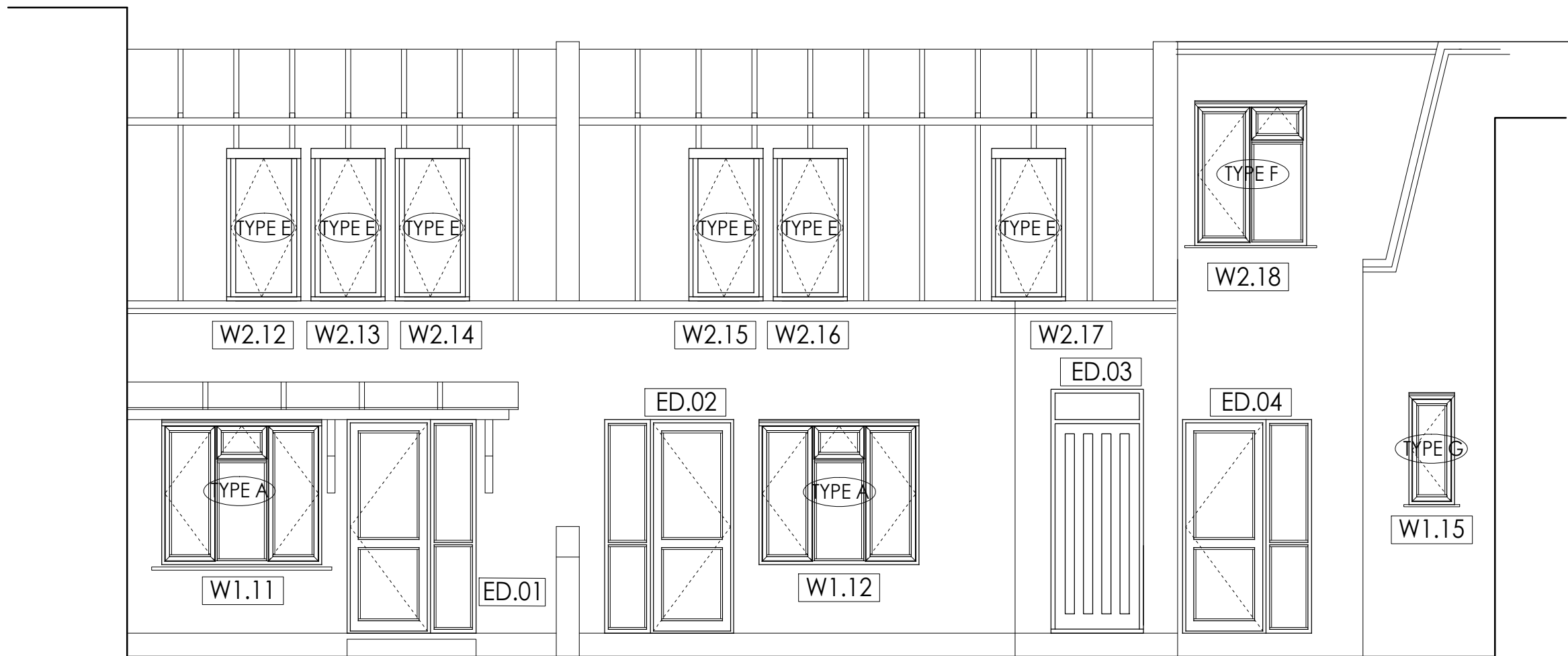
PROPOSED ELEVATION C SCALE 1:50 @ A1