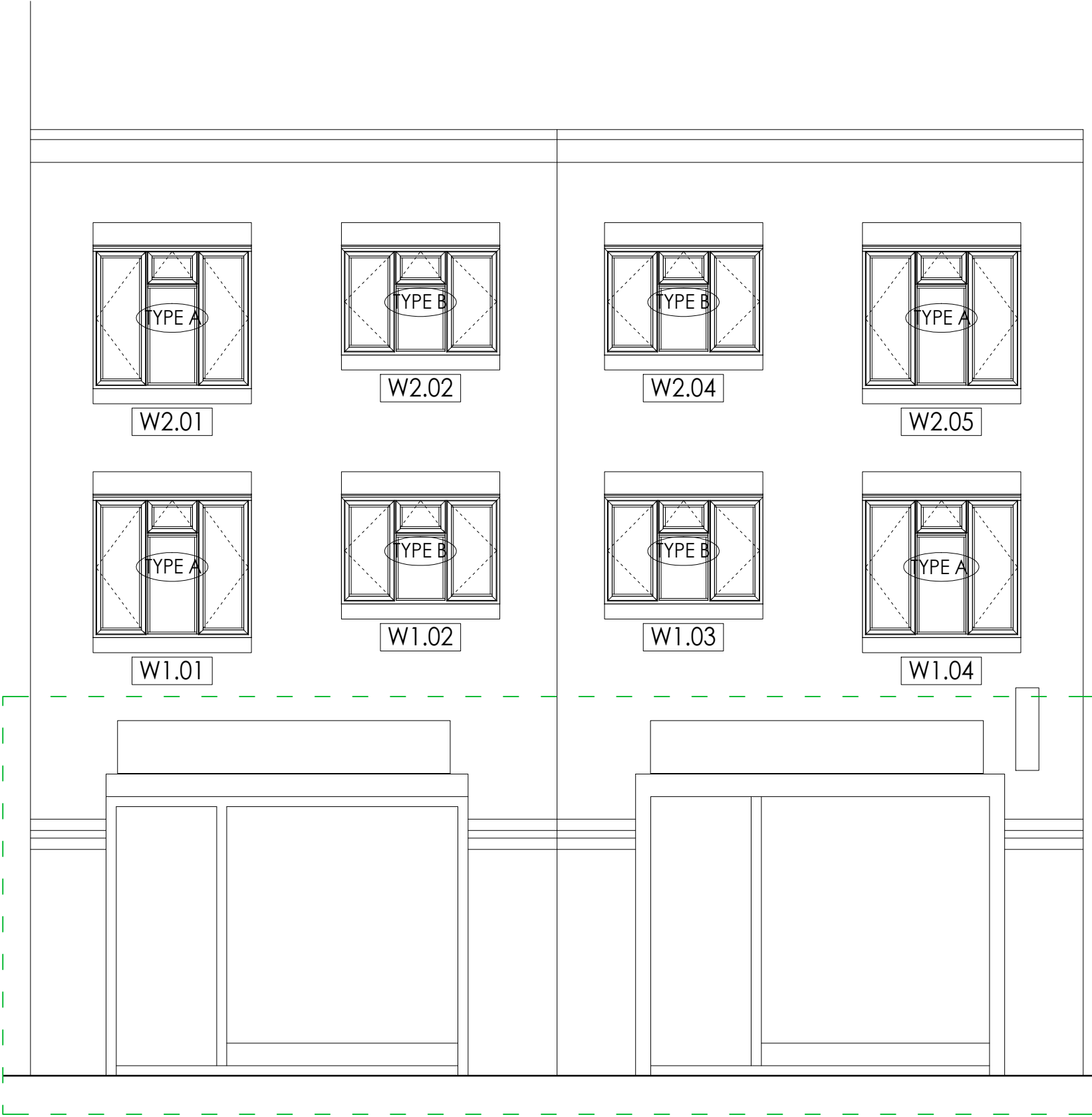
PROPOSED ELEVATION A SCALE 1:50 @ A1