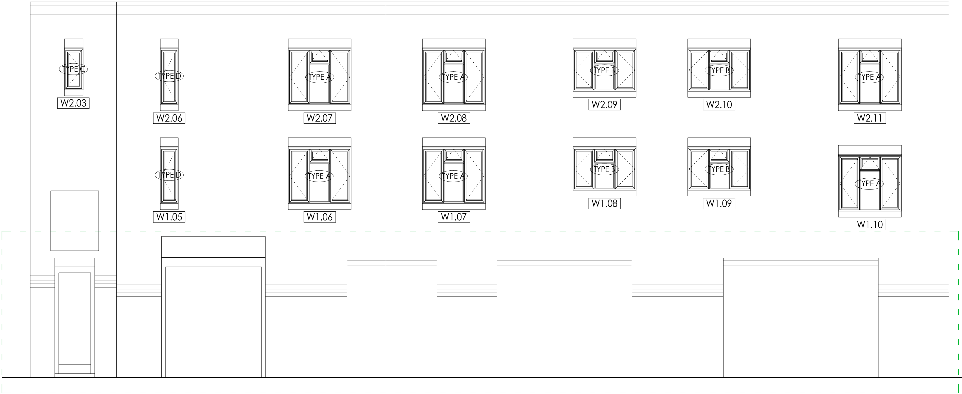
PROPOSED ELEVATION B SCALE 1:50 @ A1