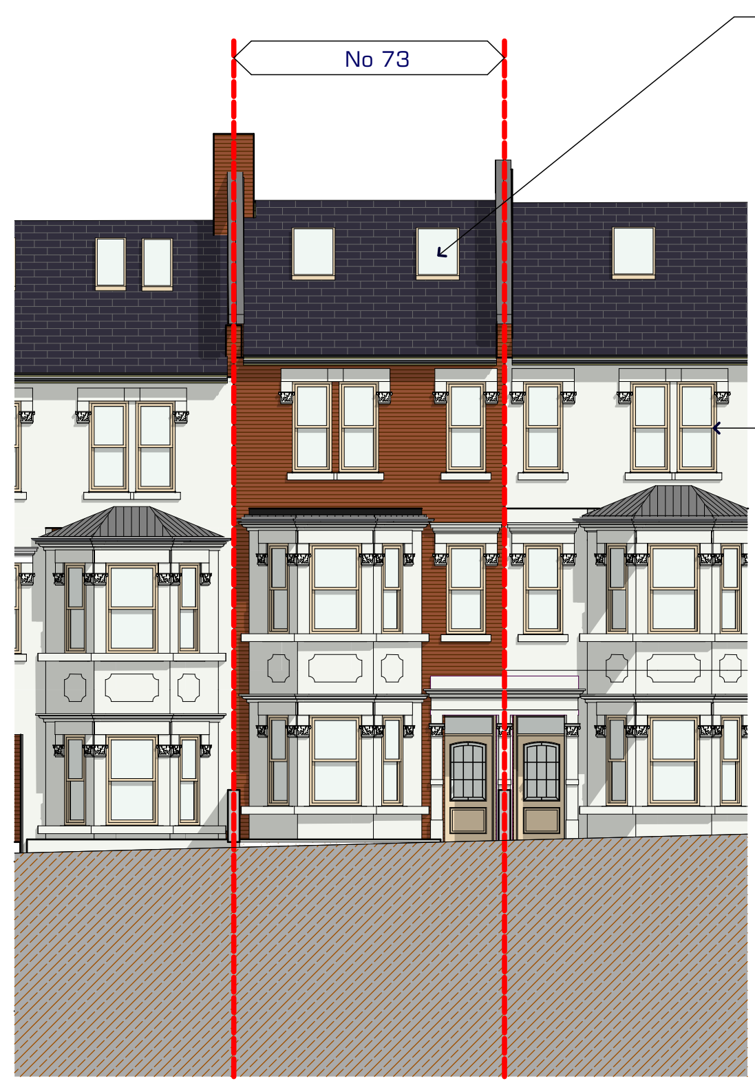
front elevation scale 1:100