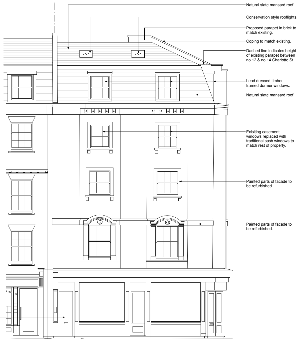
ELEVATION A (view from Windmill Street)