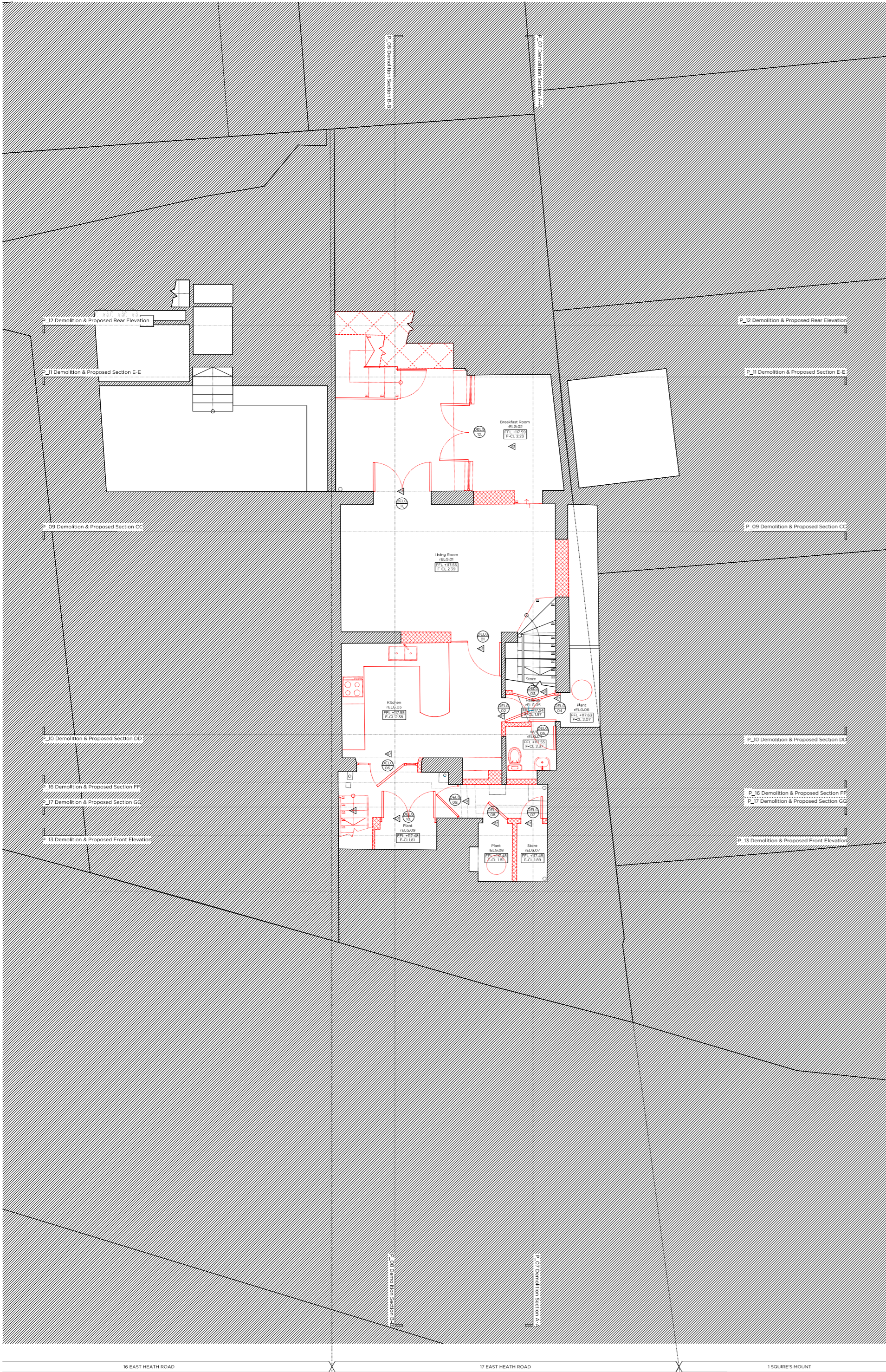
Demolition Lower Ground Floor Plan