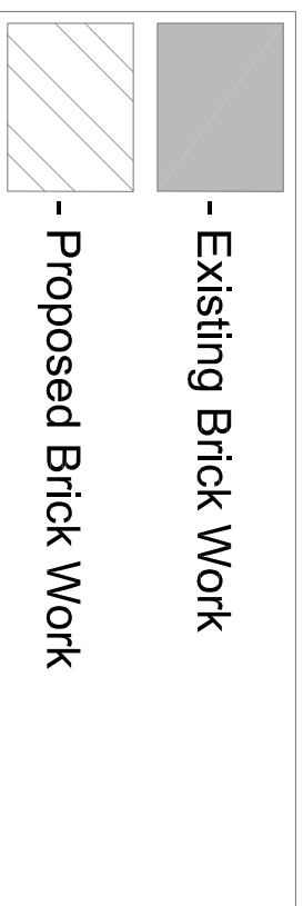
Proposed Parapet Section