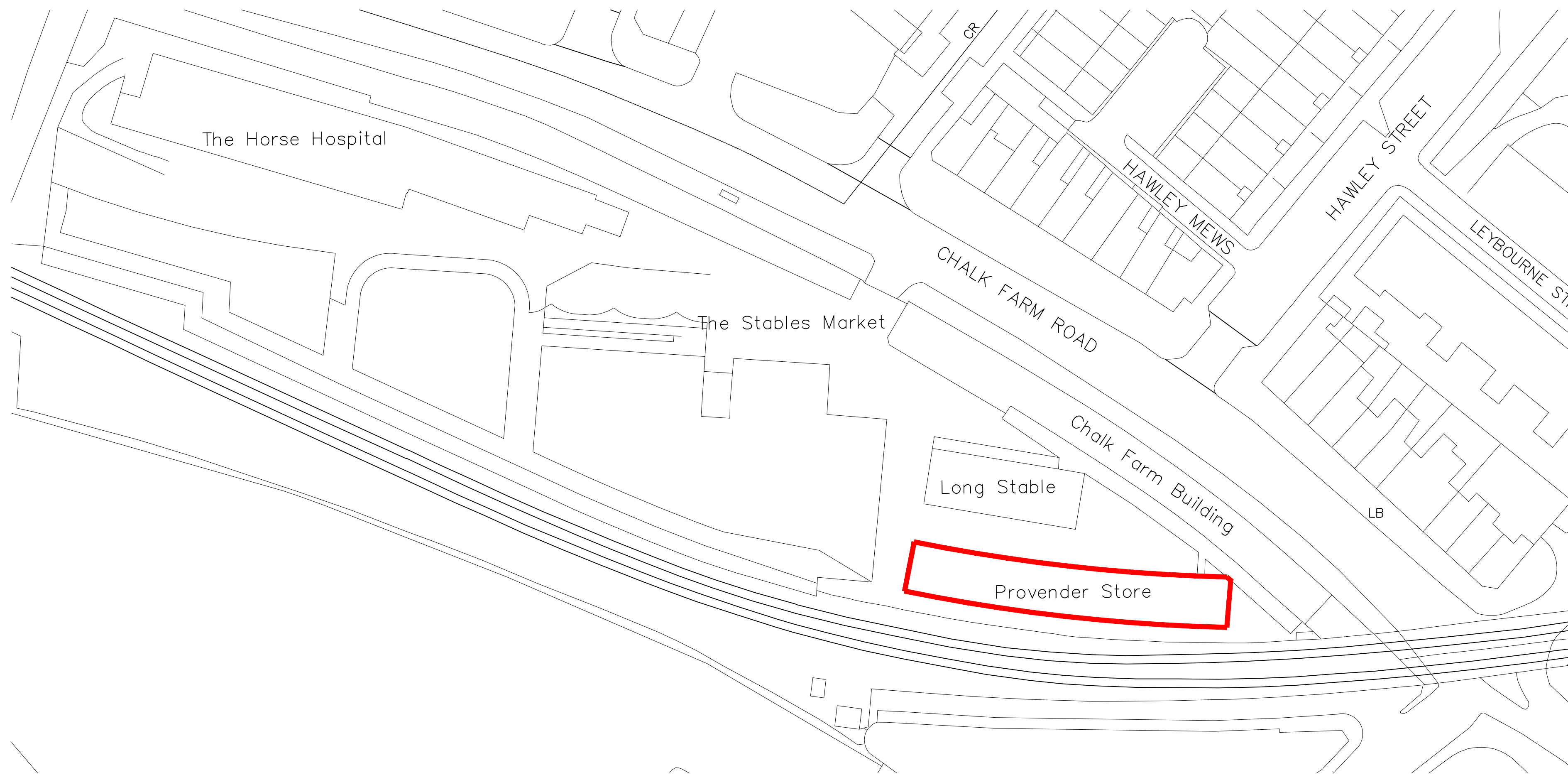
Site/Block Plan- Scale 1:500