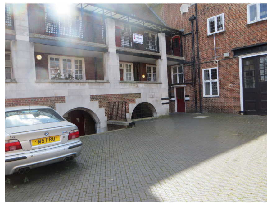
INTERNAL COURT SURFACING RETAINED