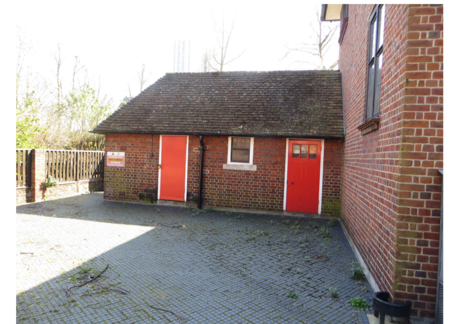
FUEL STORE TO BE REMOVED