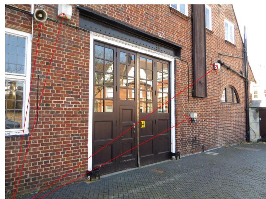
DEFUNCT ENCOUTREMENT OF FIRE STATION TO BE REMOVED, LIGHTING TO BE REPLACED