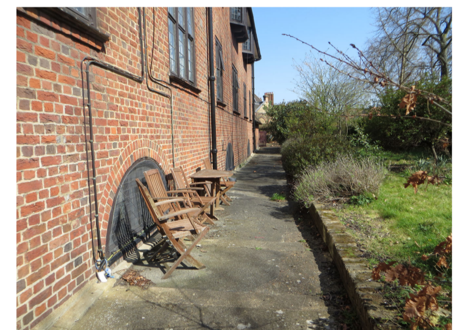
TARMACADAM SURFACE TO BE RETAINED AND REPAIRED