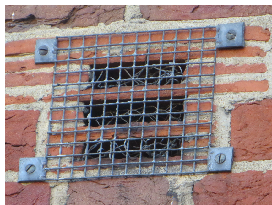
DECORATIVE TILE VENTS ON THE EXTERIOR TO HAVE MESH REMOVED AND INSECT MESH REPLACED INTERNALLY, OUT OF SIGHT