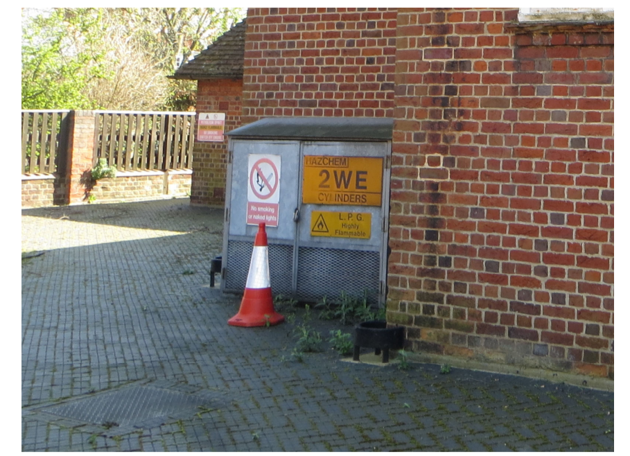
HAZARDOUS CYLINDER STORAGE TO BE REMOVED