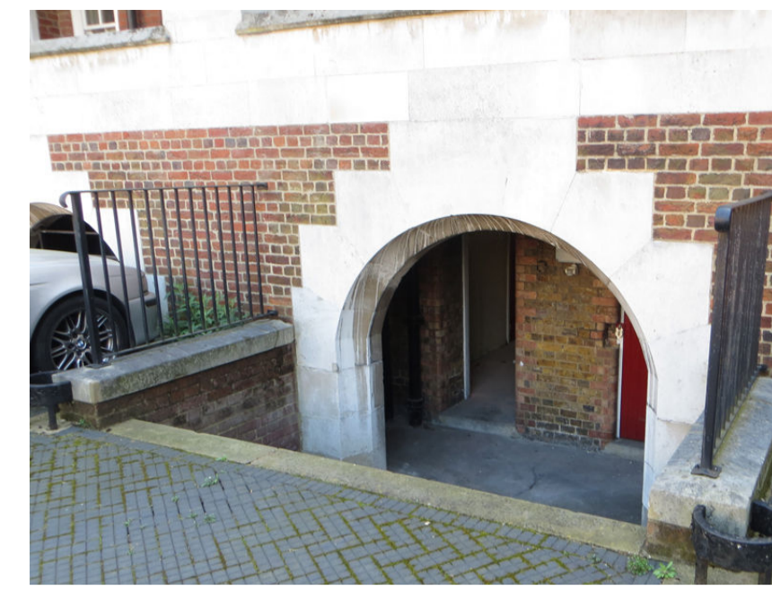
ORIGINAL RAILINGS AND CRASH GUARDS RETAINED