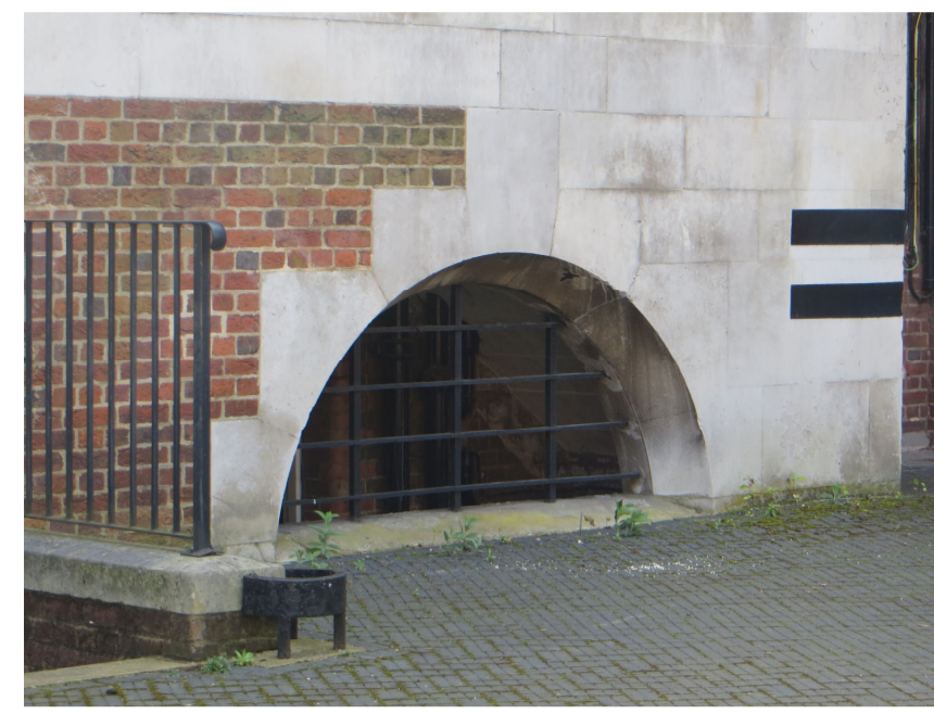
ORIGINAL, METAL ARCH GUARDING RETAINED