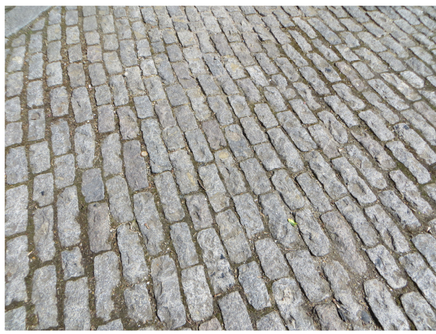
GRANITE SETTE FORECOURT RETAINED