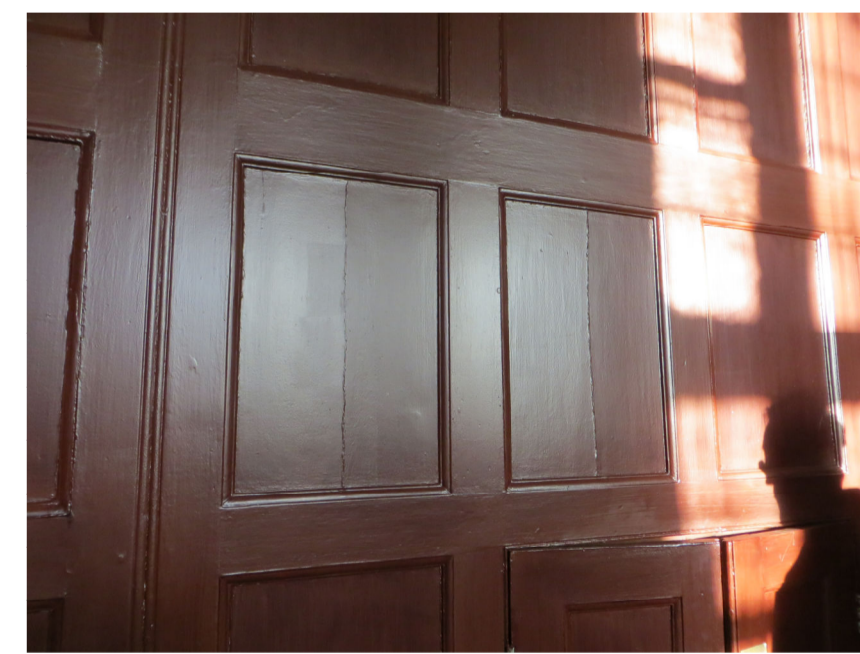
SOME PANELS SUFFER FROM A VERTICAL SPLIT DEFECT THAT WILL BE REPAIRED