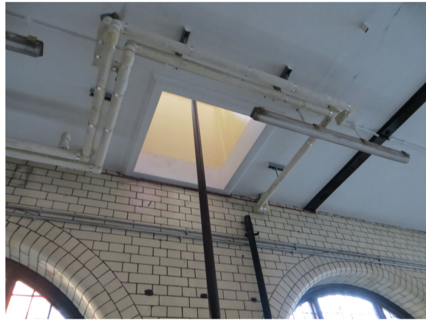
FIRE POLE RETAINED, FLOOR TO UNIT 8 ABOVE TO BE INFILLED