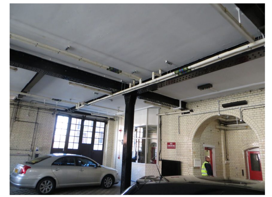
EXTERNAL AND PERSONNEL DOOR RETAINED