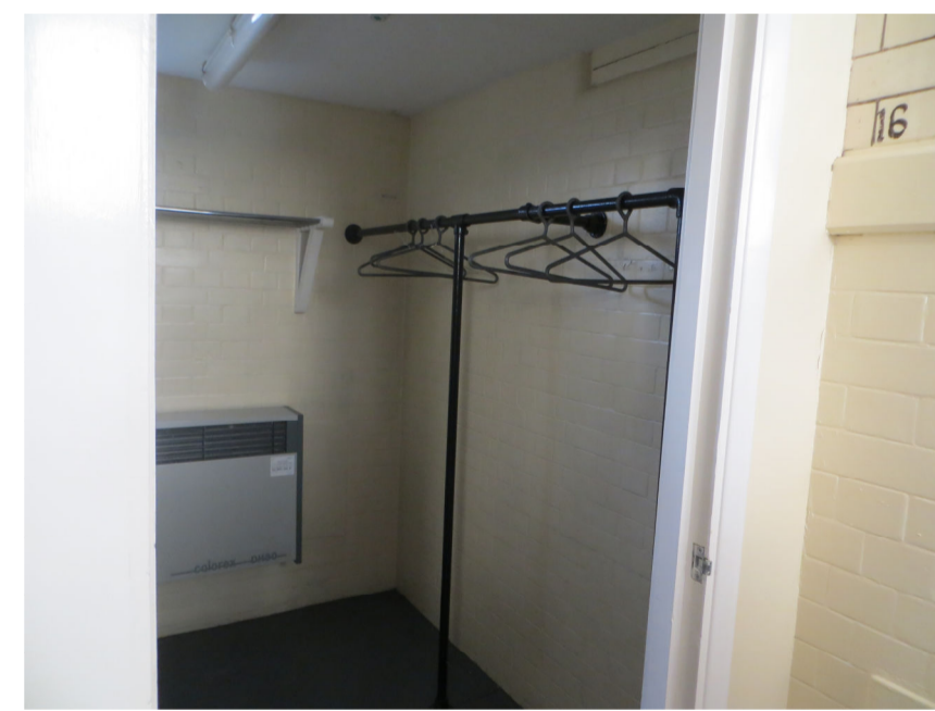
DECORATIVE METAL HANGERS TO BE REUSED IN UNIT 5 DRESSING CUPBOARD