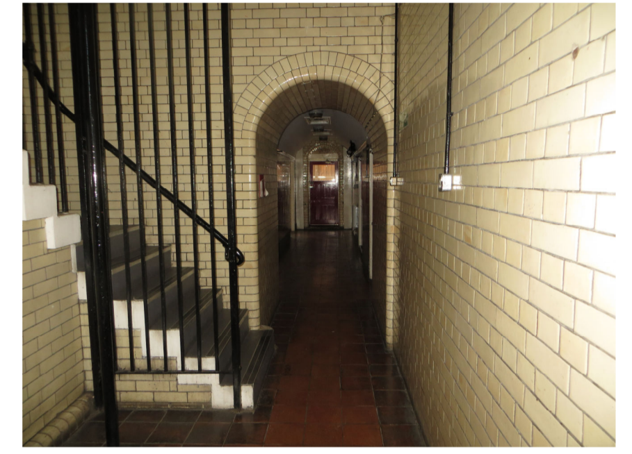
FIRE POLE RETAINED