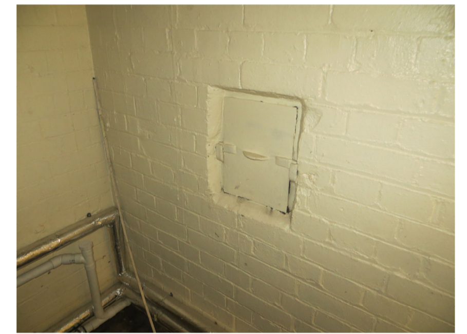
DOOR IN ORIGINAL HOT CLOSED TO BE RETAINED, BUT MOVED TO THE WEST