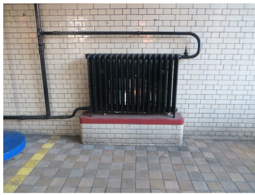
ORIGINAL CAST IRON COLUMN RADIATORS TO BE RETAINED IN UNIT 6