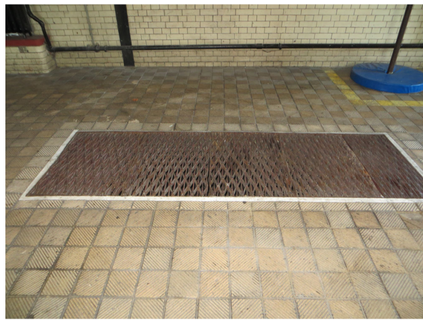
DECORATIVE GRILLE TO REMAIN FULLY INTACT UNDER NEW SACRIFICIAL FLOOR