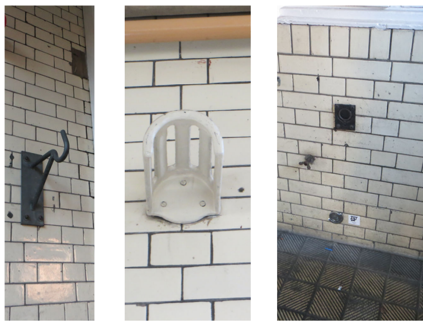
ORIGINAL HOOKS, HOSE HOOKS, AND TETHER POINTS ALL TO BE RETAINED