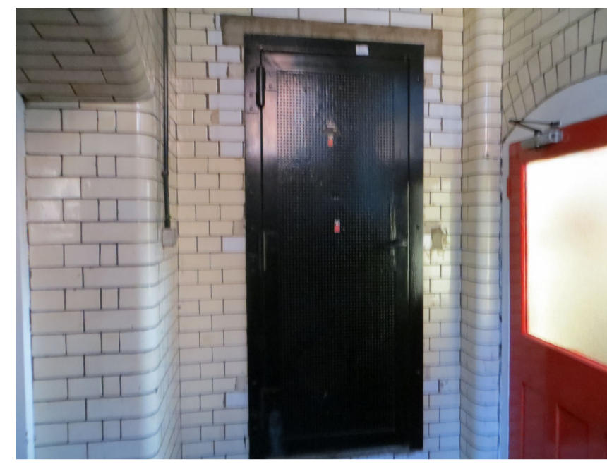
ORIGINAL CAST IRON DOOR TO BE REUSED AND LOWERED TO THE FLOOR