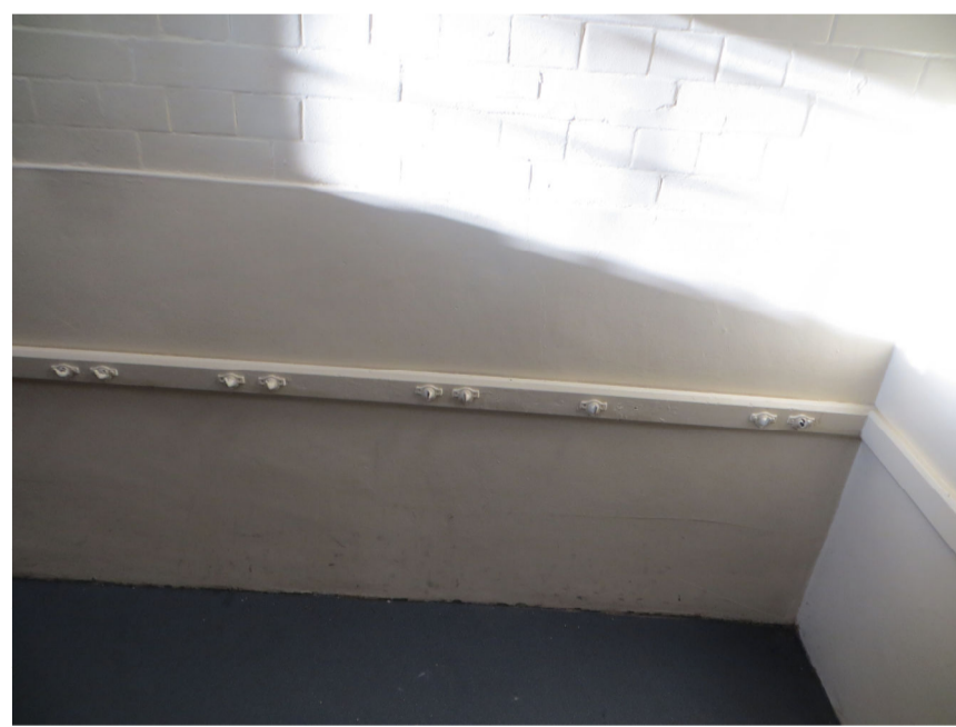
ORIGINAL FIRE BOOT HOOKS TO BE RETAINED IN THIS POSITION