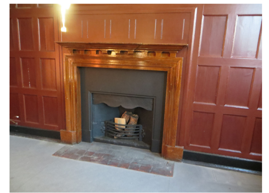
FIREPLACE, SURROUND AND ALL PANELLING TO BE RETAINED COMPLETE