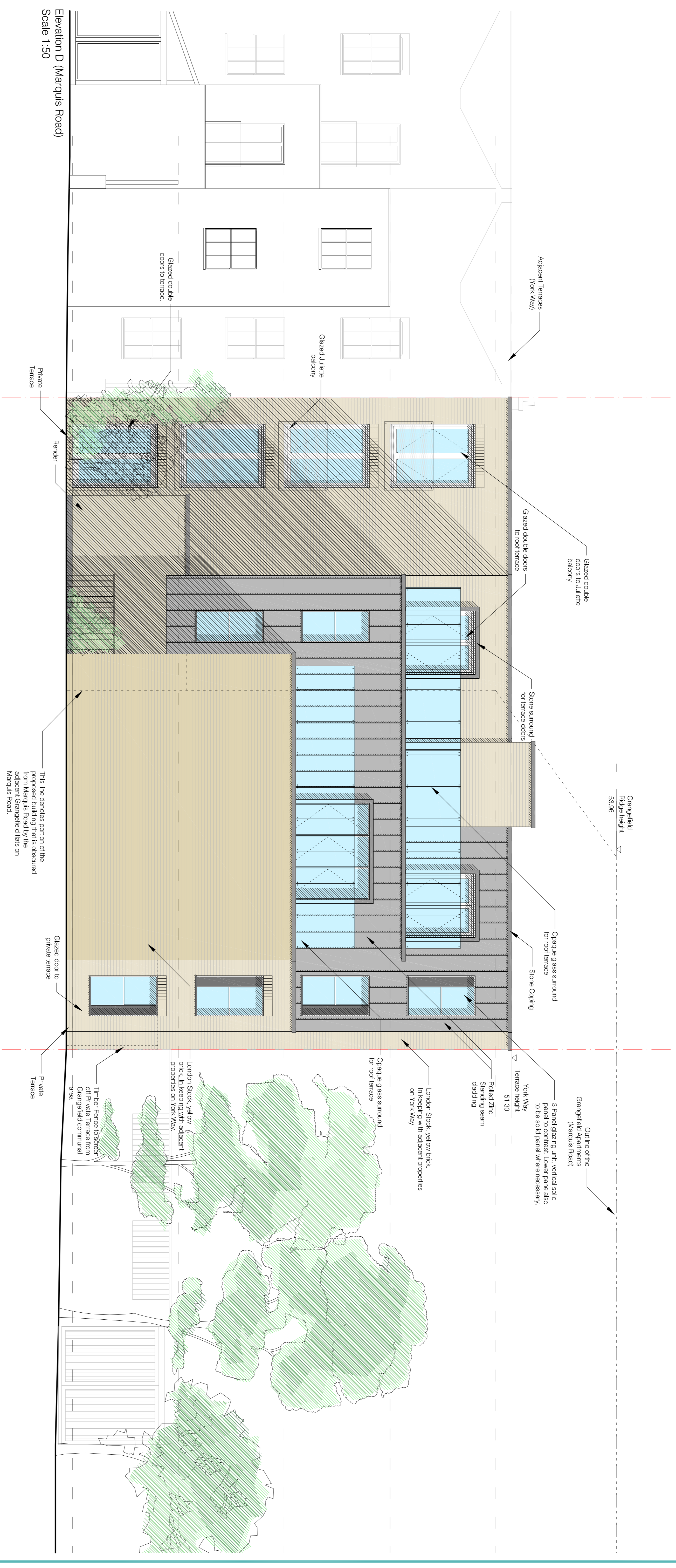
Elevation D (Marquis Road) Scale 1:50