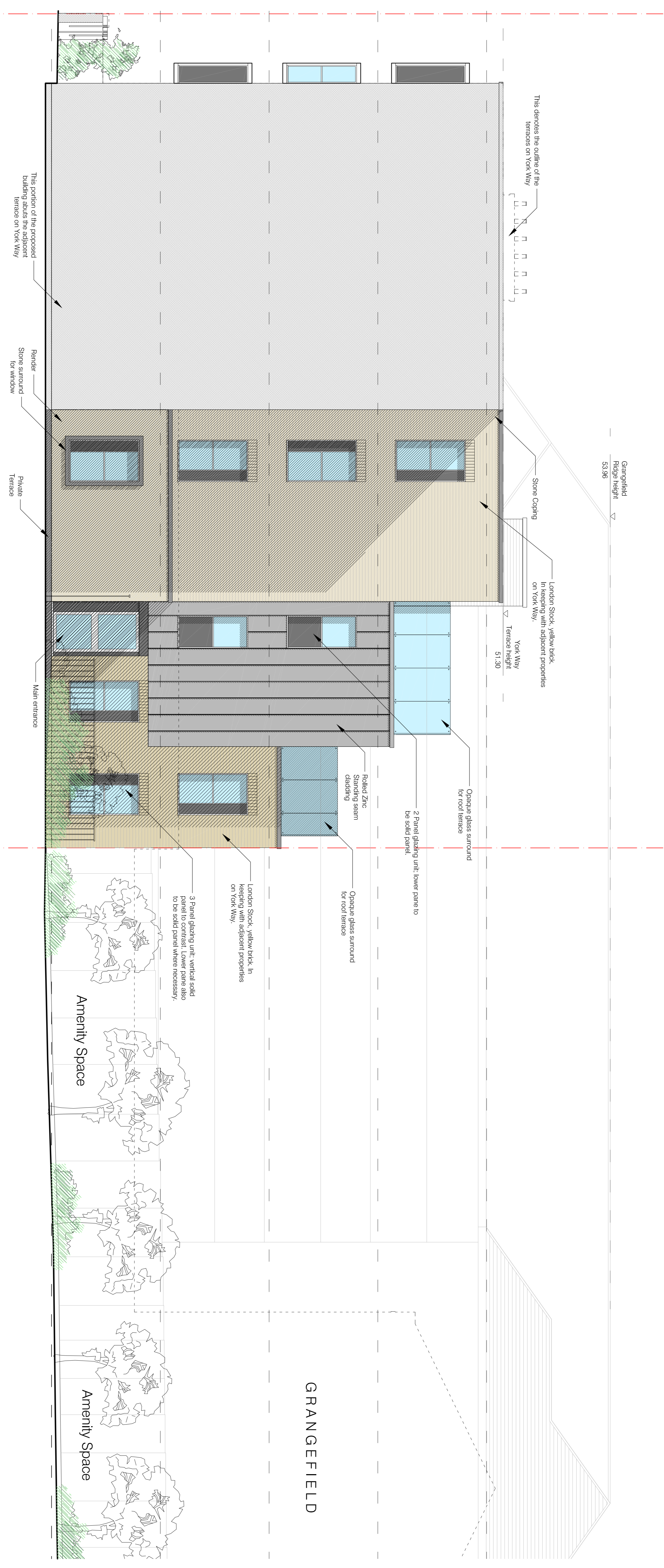
Elevation A (North Facing) Scale 1:50

The contractor must check all dimensions, levels and work prior to commencement of work. Box Architects to be notified of any discrepancy. Do not scale from drawing. Requirements and finish standards, where not stated, are based on the drawing. The contractor is responsible for ensuring all works comply with all relevant statutory provisions as listed. The drawing must not be copied, altered, reproduced, sold, lent, or otherwise used without prior written permission.