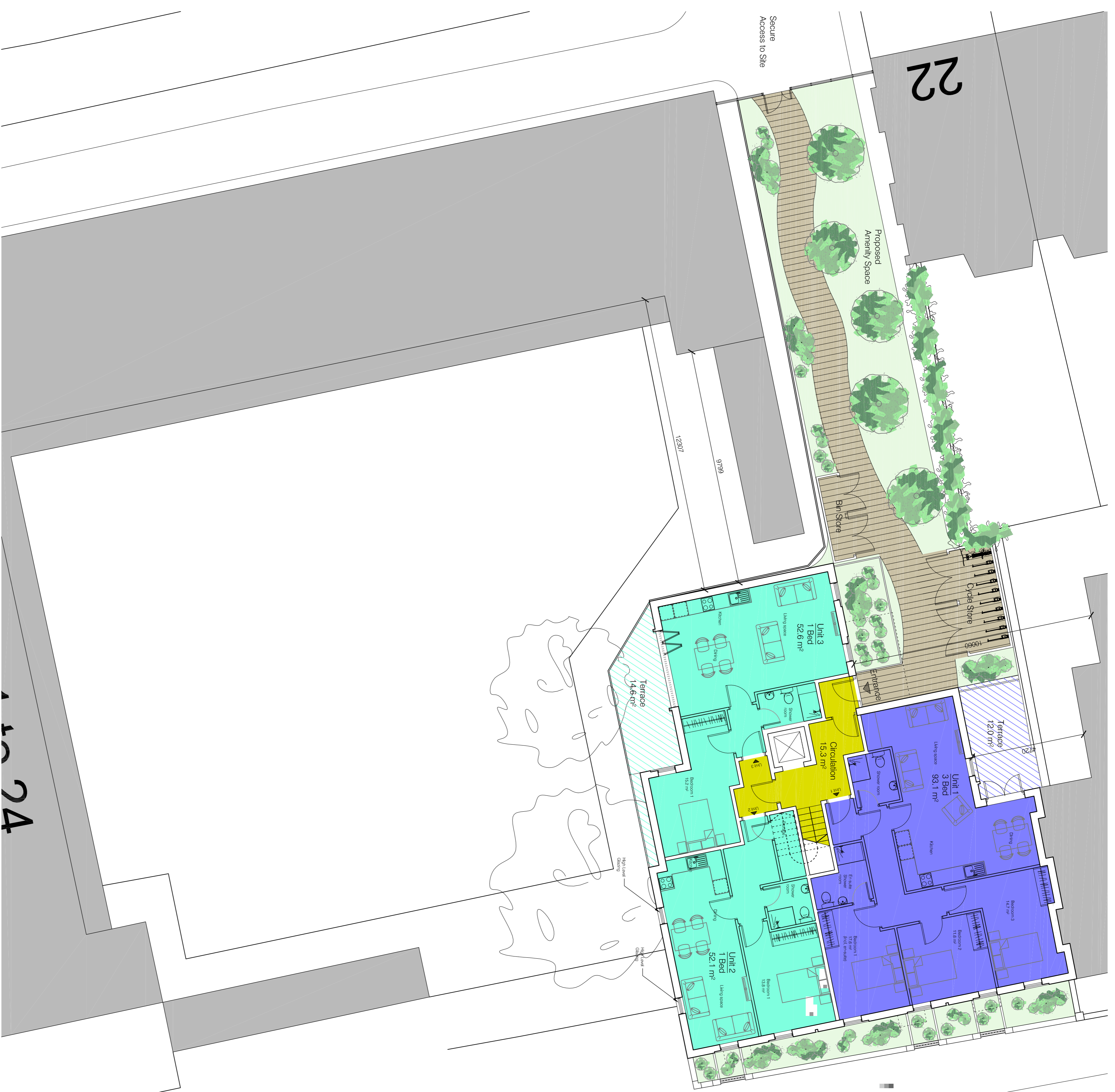
Site Plan / Ground Floor Scale 1:100