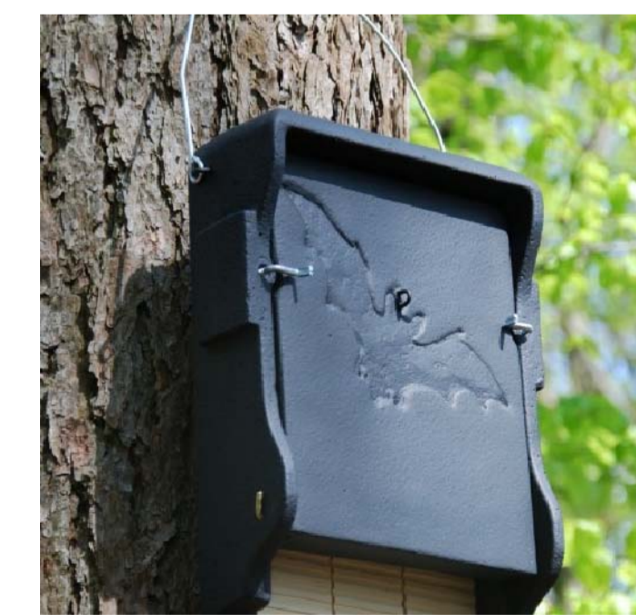
BB-2 Bat Box Type 2: Schwegler 1ff flat bat box Installed to manufacturers guidelines