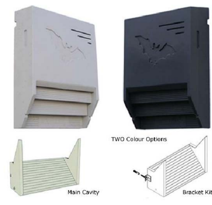
BB-1 Bat Box Type 1: Schwegler 1ff universal summer roost bat box Installed to manufacturers guidelines