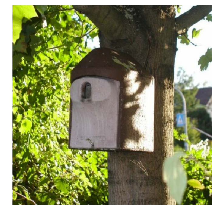
BBb Bird Box Type b: Schwegler 2GR anti cat box installed to manufacturers guidelines