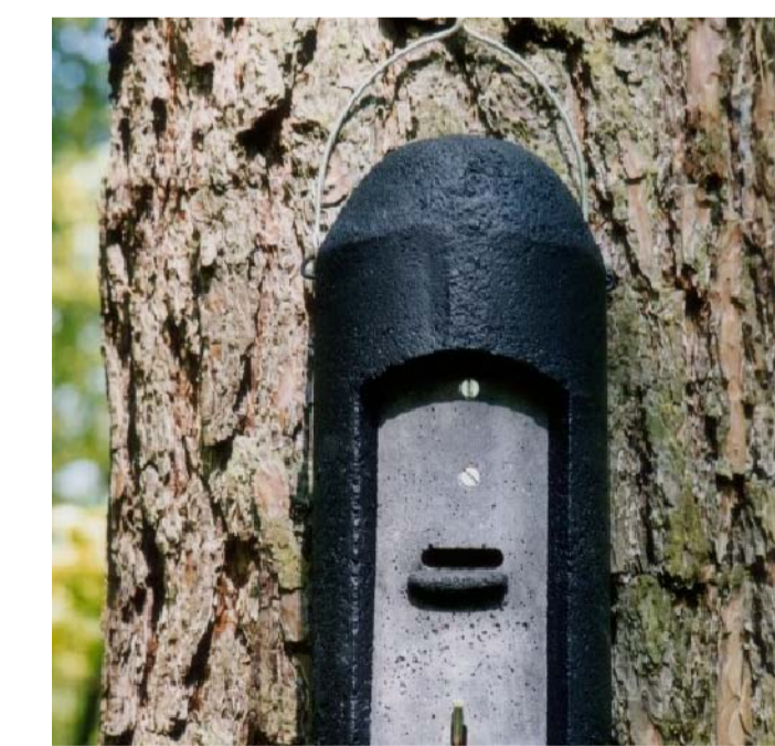
BB-3 Bat Box Type 3: Schwegler 1fd triple front panel Installed to manufacturers guidelines