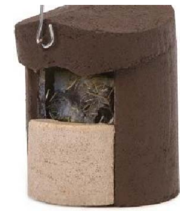
BBa Bird Box Type a: Schwegler 2H Robin box Installed to manufacturers guidelines