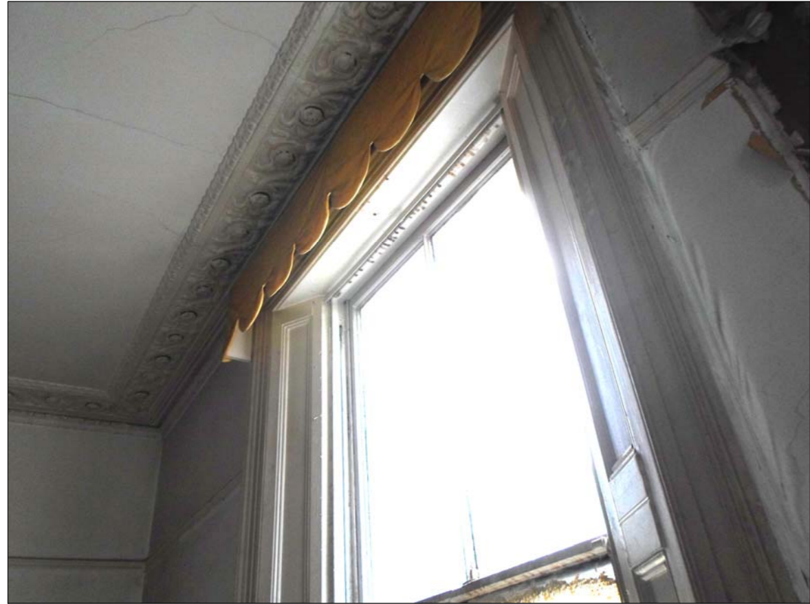
TYPICAL EXISTING WINDOW AT FIRST FLOOR