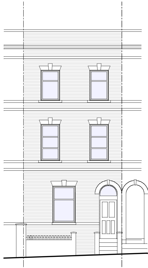
proposed front elevation 1:100