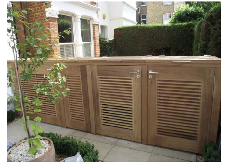
timber cycle store