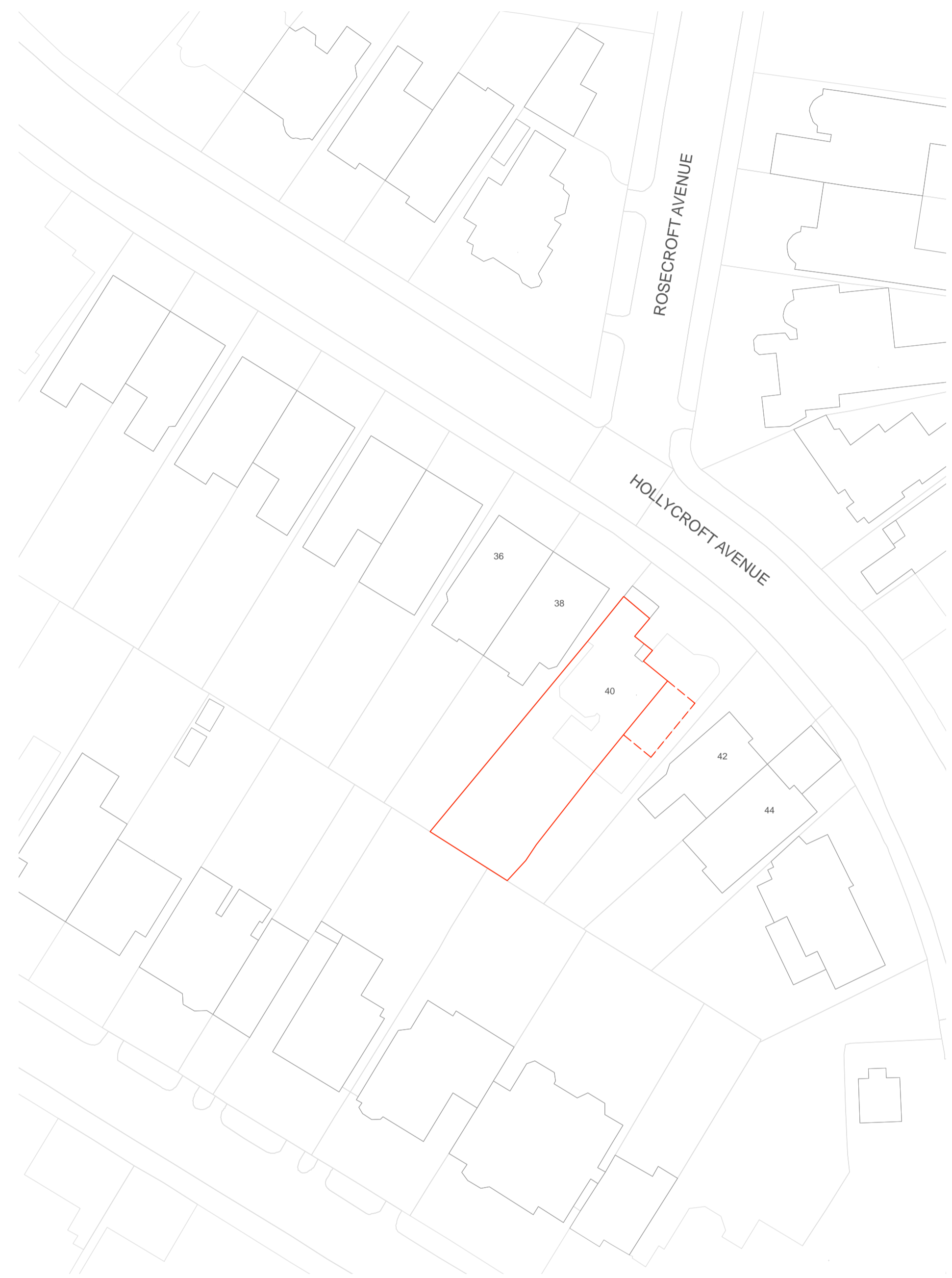
Location Plan 1:500

Boundary of development site at Ground Floor ———— 40B ownership at first and second floor shown in dashed line - - - - -