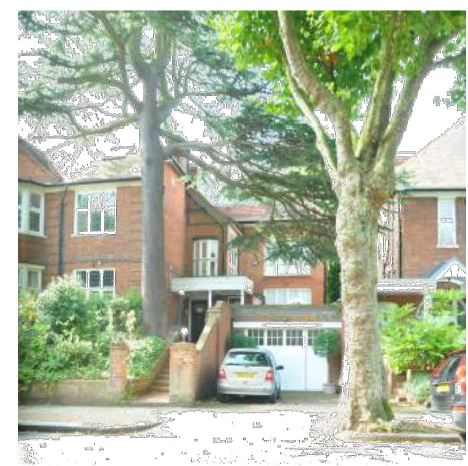
Street view - Front elevation