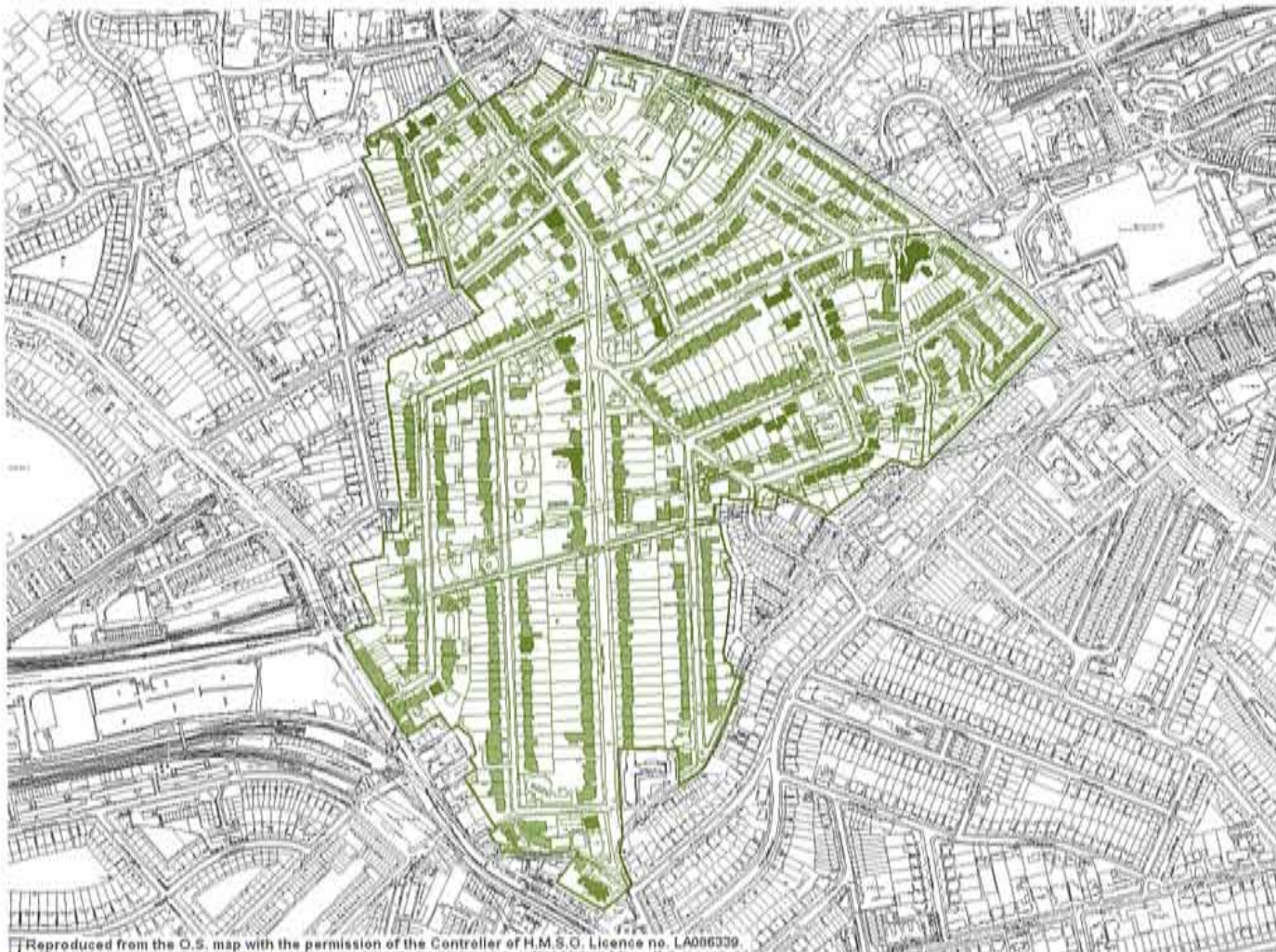
Reproduced from the O.S. map with the permission of the Controller of H.M.S.O. Licence no. LA006339

■ Listed buildings and ■ buildings that make a positive contribution