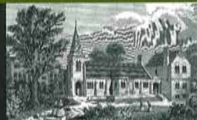
Soldiers Daughters Home School