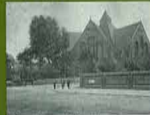
Lyndhurst Road Congregational Church

Development of the Rosslyn Park Estate started in the 1860s under Davidson and was largely completed in the 1880s. In 1862 development on Thurlow, Lyndhurst, Eldon Roads and Windsor Terrace was proceeding. Houses in a similar style were also built on the west side of Rosslyn Hill. The substantial three/four storey houses were built around the boundaries of the estate (see 1870 map) with no connecting roads between Lyndhurst Road and the area west of it. A through route was only established when Fitzjohns Avenue was built. Lyndhurst Road was named after a Lord Chancellor, as was Thurlow Road and Eldon Grove. Wedderburn Road, to the west of Belsize Court, was built in the 1880 and 1890s. In 1883 the Rosslyn Grove Congregational Church was built adjacent to the Lodge, designed by Alfred Waterhouse. It was later known as the Lyndhurst Road Congregational Church and is now the Air Recording Studios.