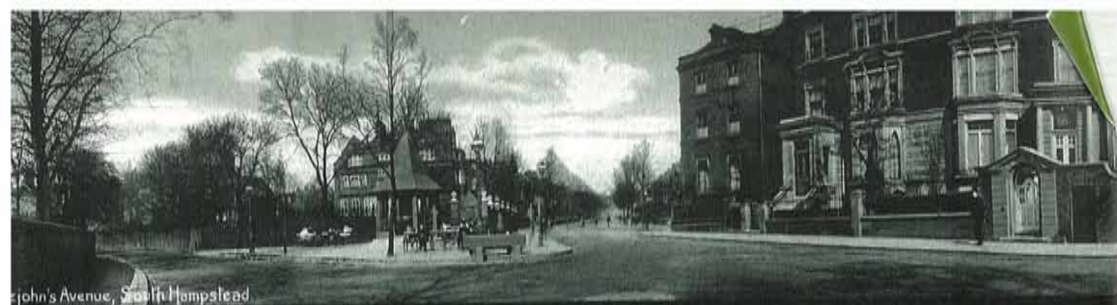
John's Avenue, South Hampstead