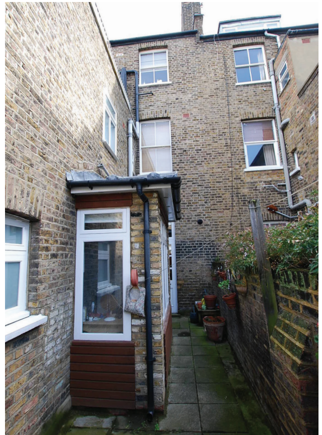
Side of Existing Extension Towards the House