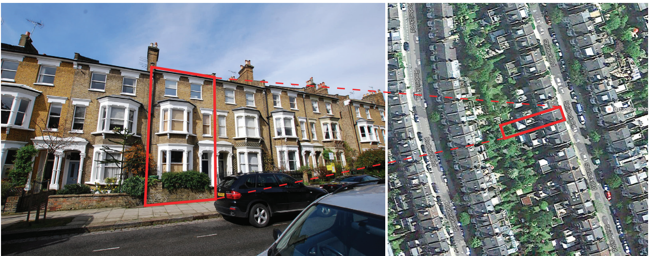
29 Shirlock Road

'The original historic pattern of rear elevations within a street or group of buildings is an integral part of the character of the area and as such rear extensions will not be acceptable where they would diverge significantly from the historic pattern.'