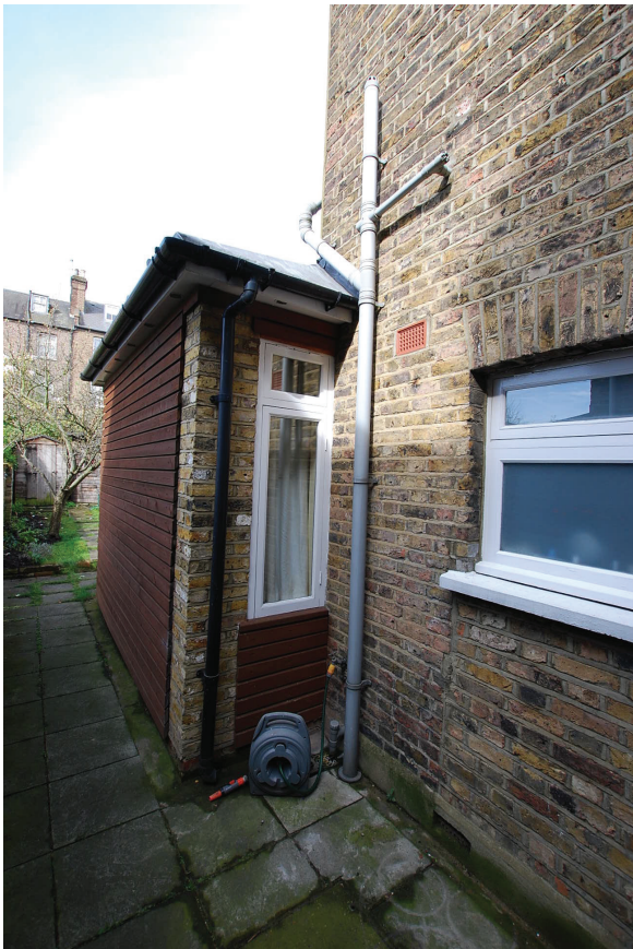
Side of Existing Extension Towards the Garden