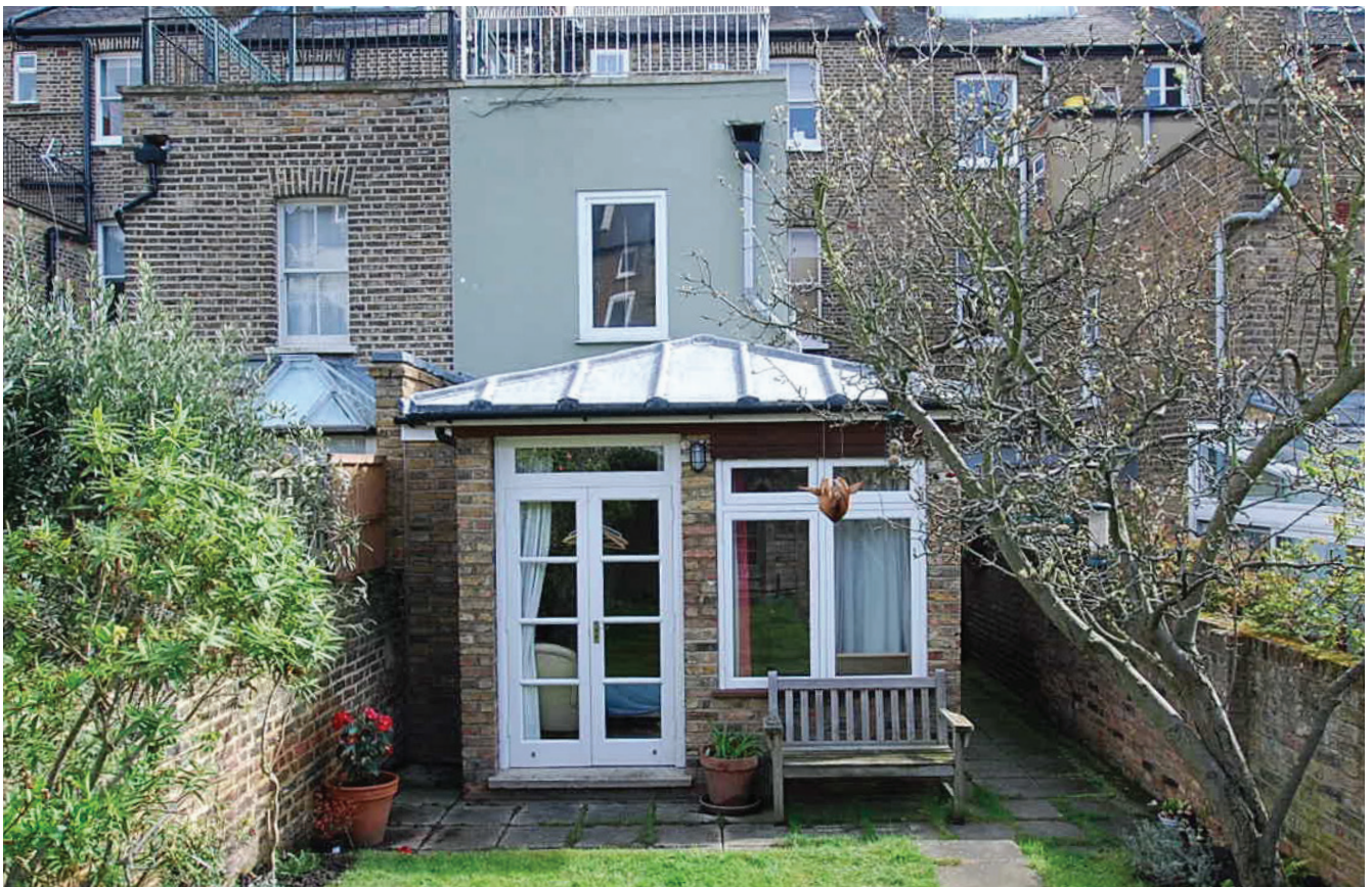
View of Existing Extension from Garden