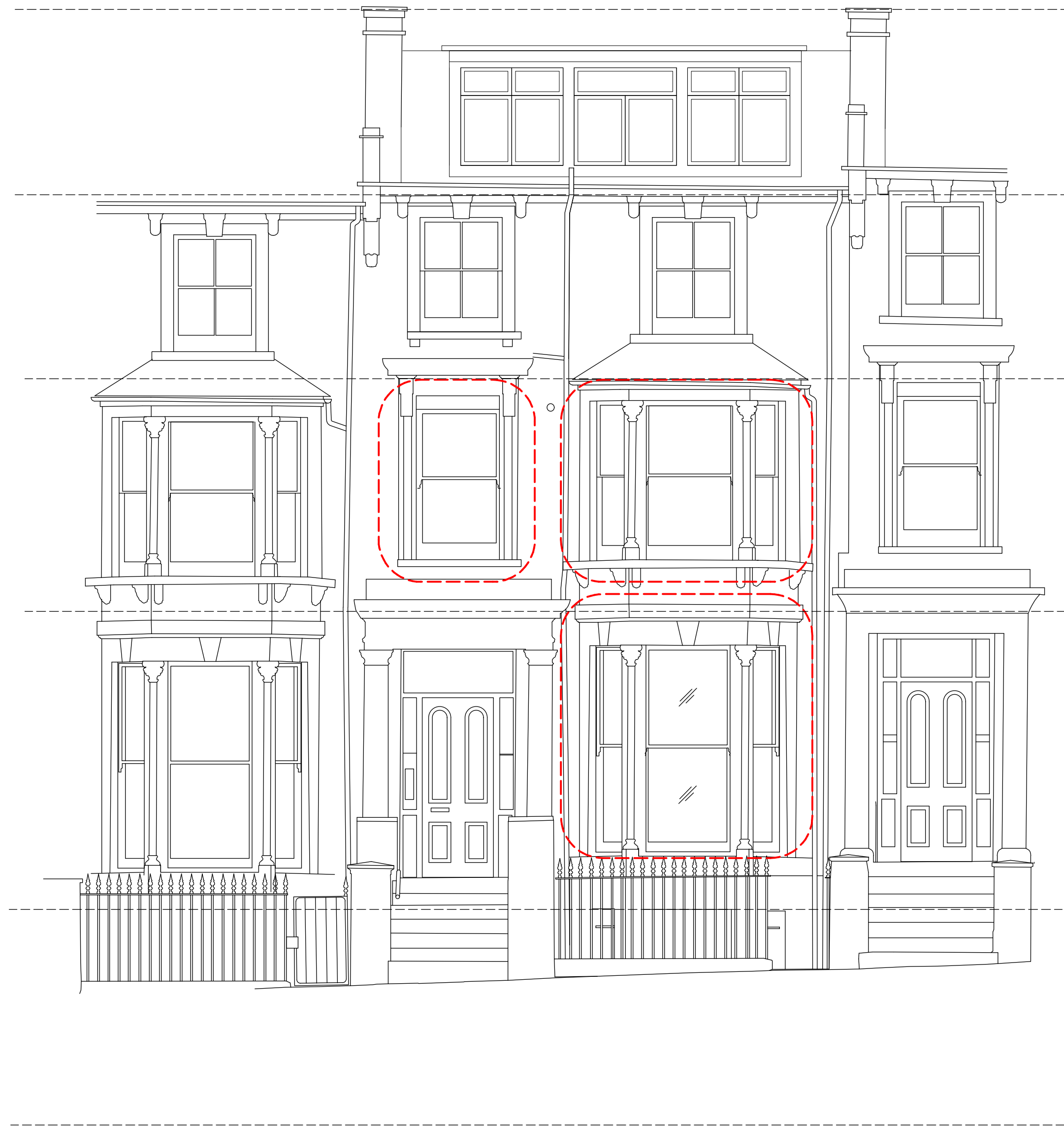
PROPOSED FRONT ELEVATION 1m 2 3 4 5 scale 1:100 @ A3