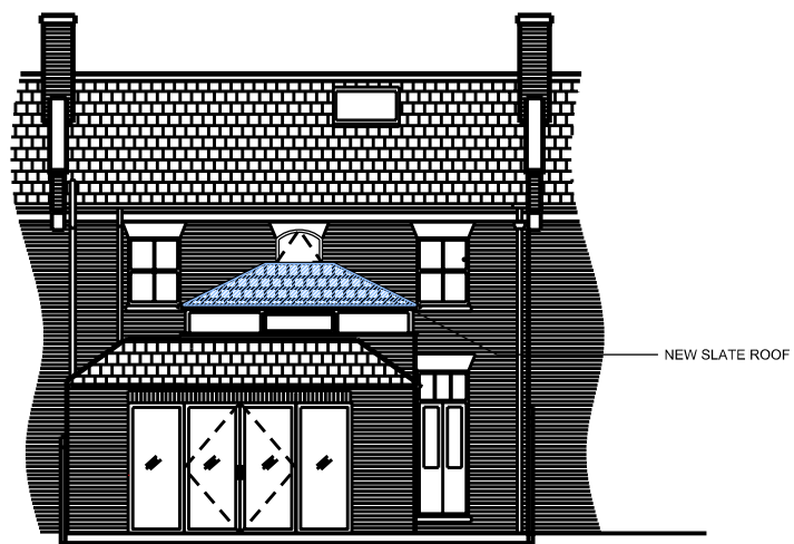
1 1:50 PROPOSED FRONT ELEVATION