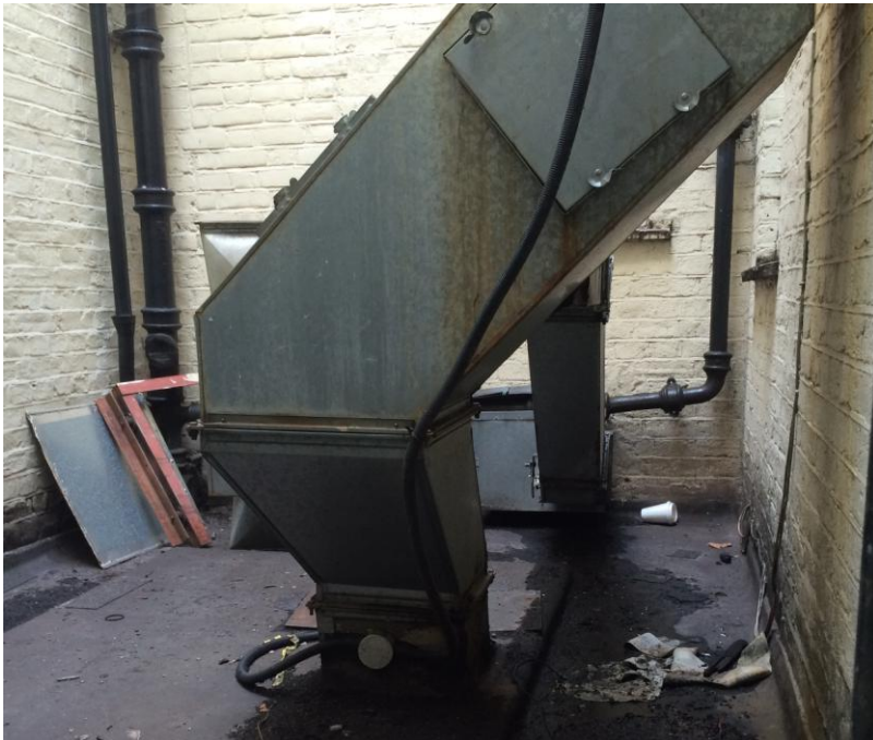
EXTRACT RISING THROUGH FLAT ROOF OVER GROUND FLOOR AND OFF-SETTING TO RISE UP IN LIGHT WELL