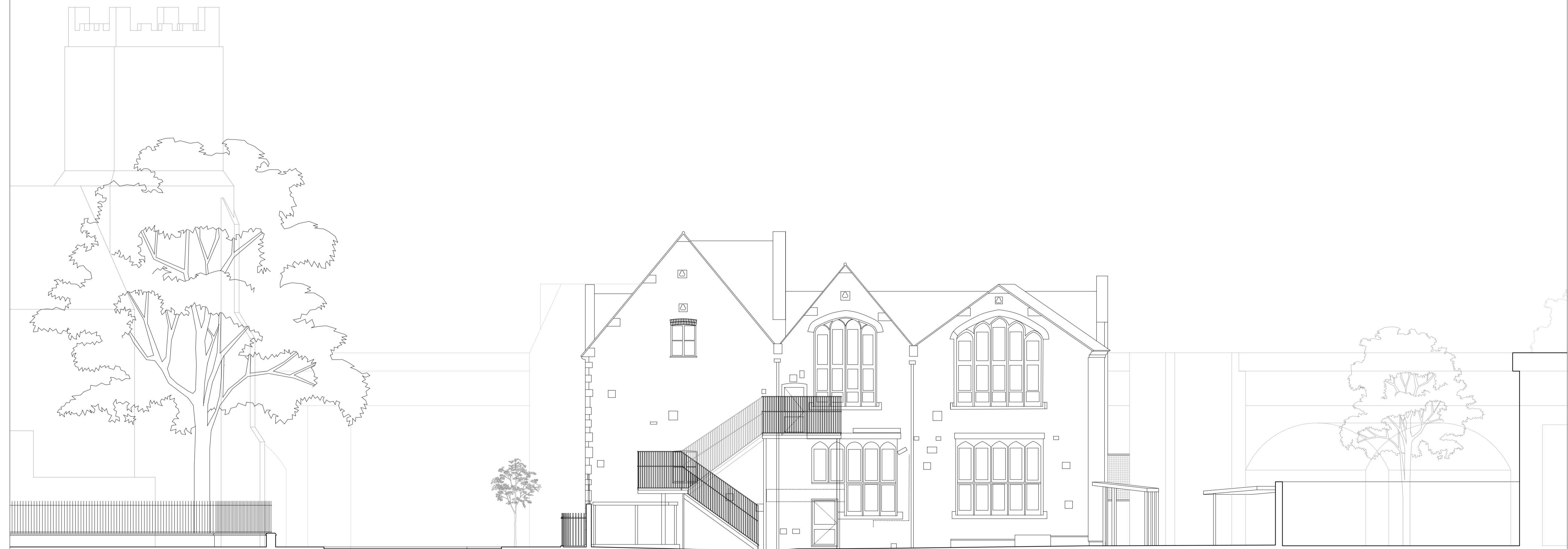
Existing South East Elevation

THE MOST HOLY TRINITY CHURCH FOOTPATH HARTLAND ROAD FOOTPATH EXISTING HOLY TRINITY + ST SILAS PRIMARY SCHOOL PLAYGROUND BRIDGE