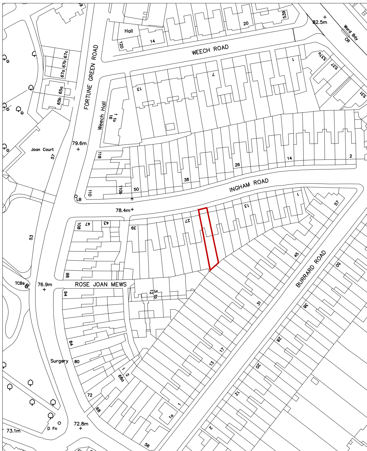
SITE LOCATION SCALE 1:1250

Note: This drawing has been drawn to scale for the purposes of obtaining local authority approval. Any measurements required for construction must not be scaled from this drawing. All structural elements to be agreed with local authority Building Control prior to commencement of works. Attention is drawn to the provisions of the party wall act 1996. Legal boundaries should be determined by others.