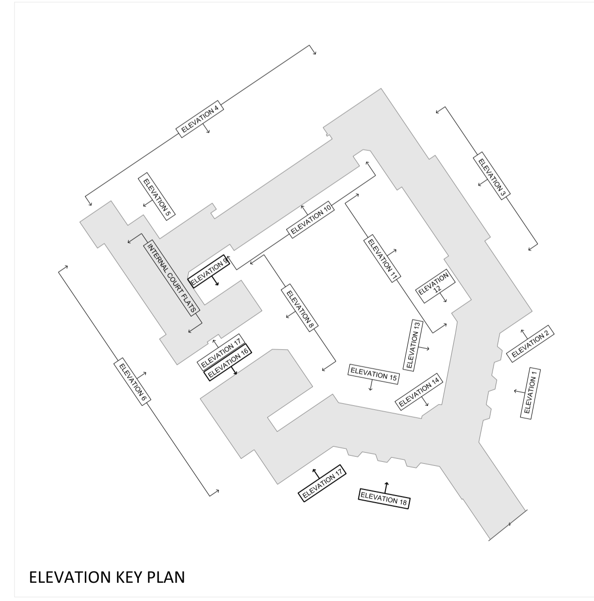
ELEVATION KEY PLAN