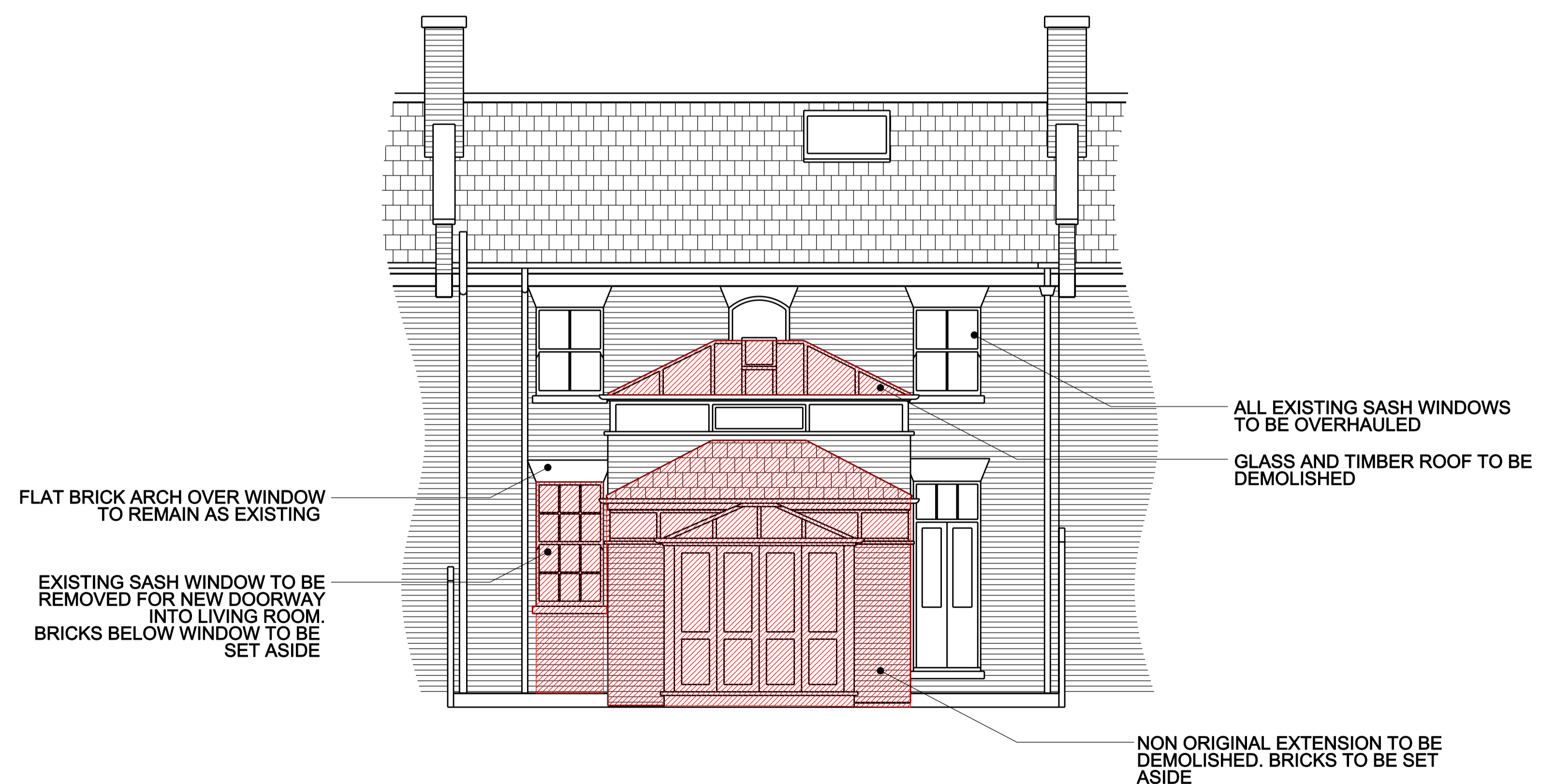
1 1:50 EXISTING FRONT ELEVATION