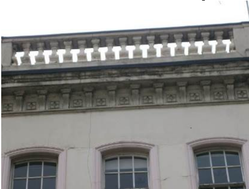
Front Elevation – Second Floor & First Floor – flaking decoration & cement render