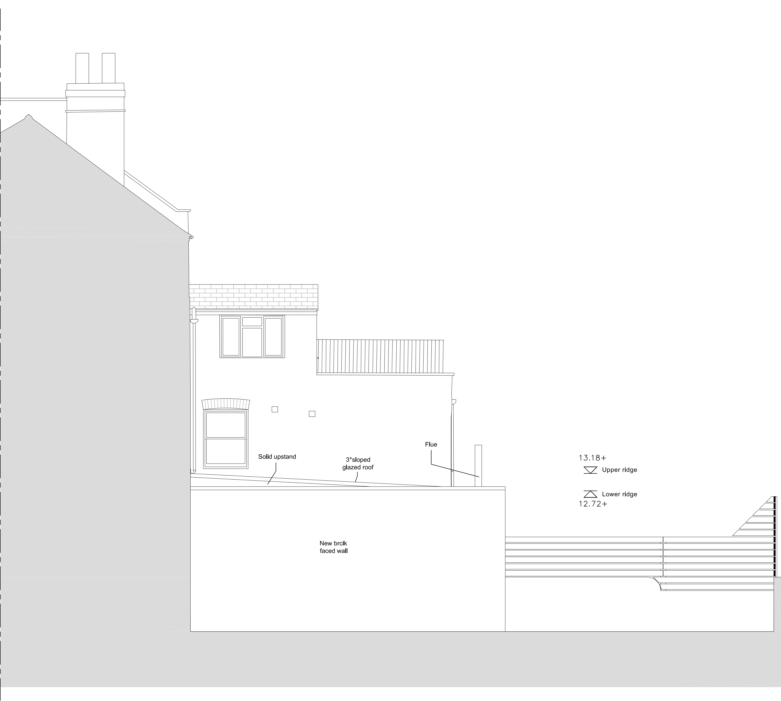
NEIGHBOURS VIEW ELEVATION

97.96+ ▽ BS FI Ref: SDA Drwg No. 251/PD/008