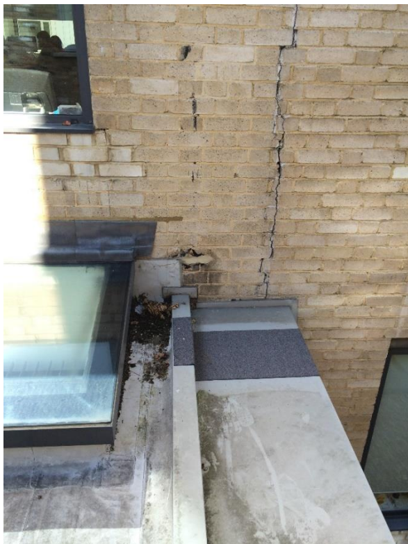
IMAGE 8: View towards the rear of 16 – 18 Kirby Street and 106-109 Saffron Hill showing roof detail including sky lights.