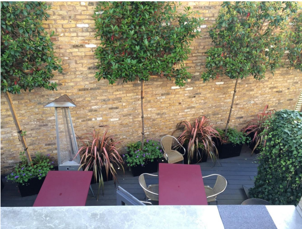
IMAGE 10: View towards 106-109 Saffron Hill showing the Roof Terrace below the 2 nd floor of 16-18 Kirby Street.