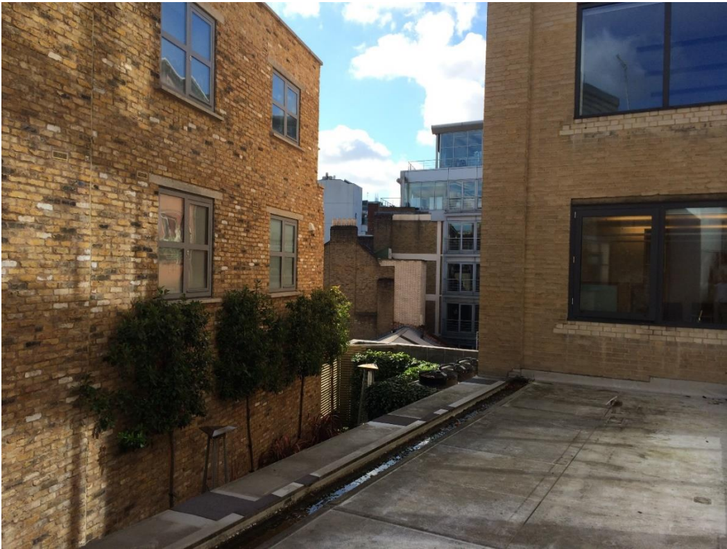
IMAGE 5: View towards the rear of 16 – 18 Kirby Street and 106-109 Saffron Hill