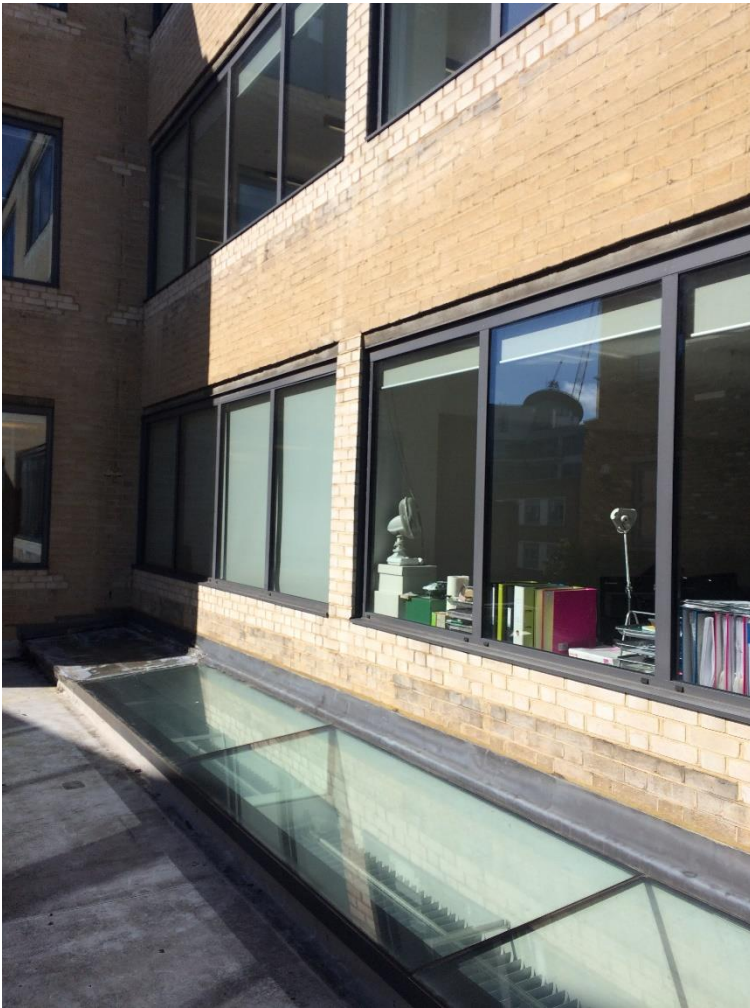
IMAGE 7: View towards the rear of 16 – 18 Kirby Street and 106-109 Saffron Hill showing the 2 nd floor windows and the sky lights situated on the flat roof.