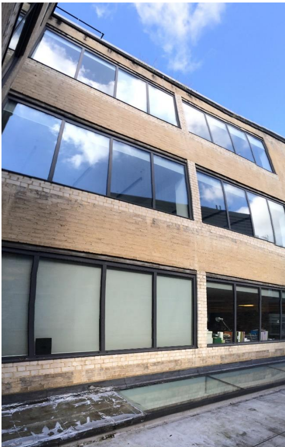
IMAGE 6: View towards the rear of 16 – 18 Kirby Street and 106-109 Saffron Hill showing the floors above the 2 nd floor.