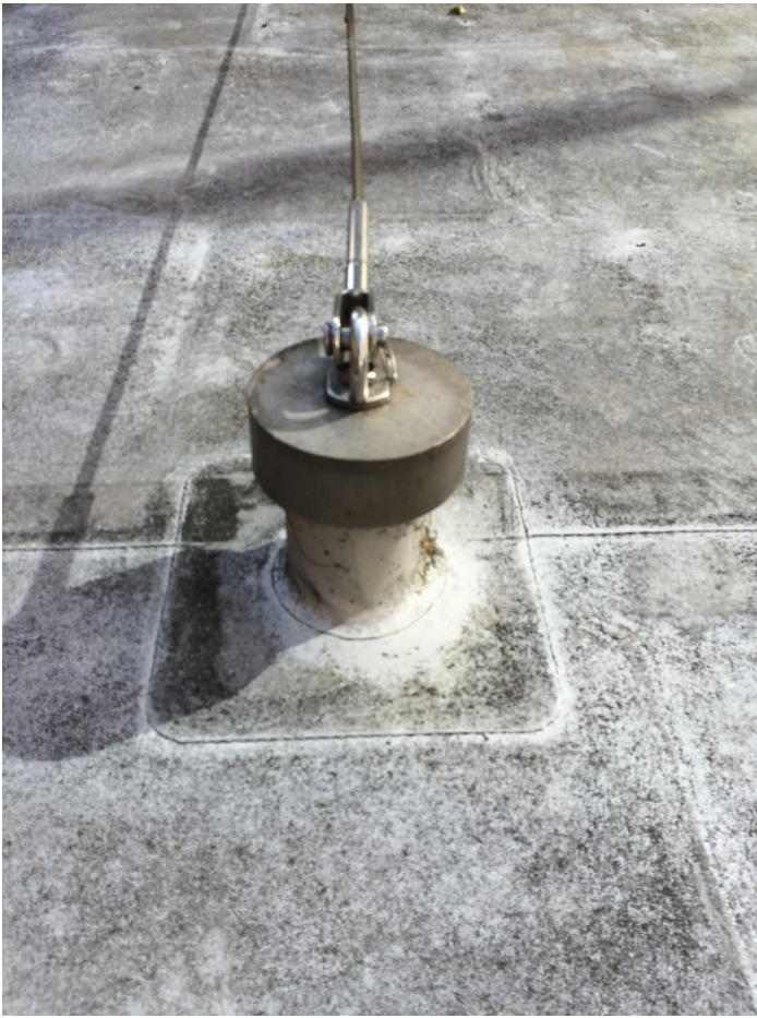
IMAGE 9: Image showing the man safe system that is situated on the roof.