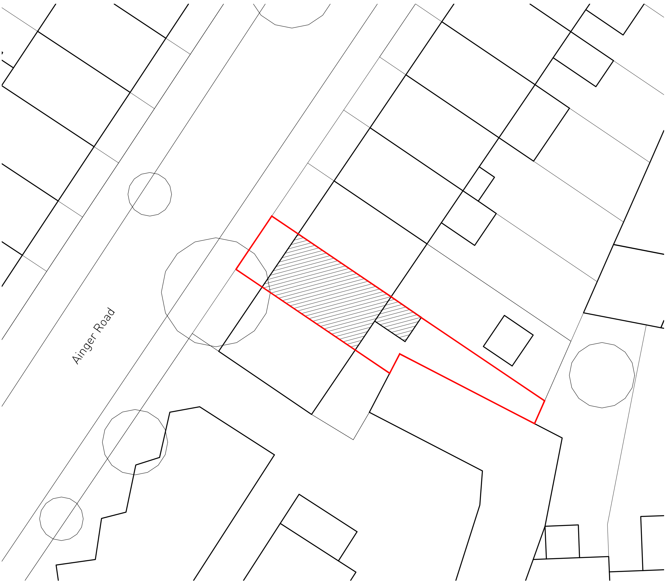
SITE BLOCK PLAN - 1:200