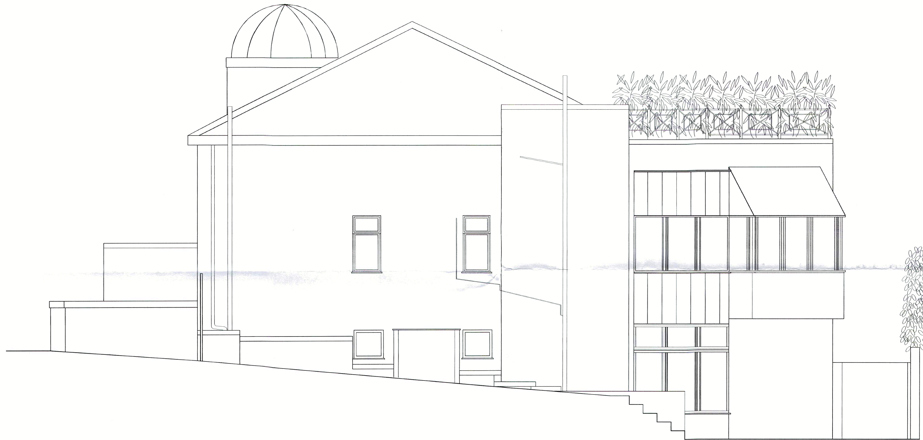
EXISTING RIGHT SIDE ELEVATION