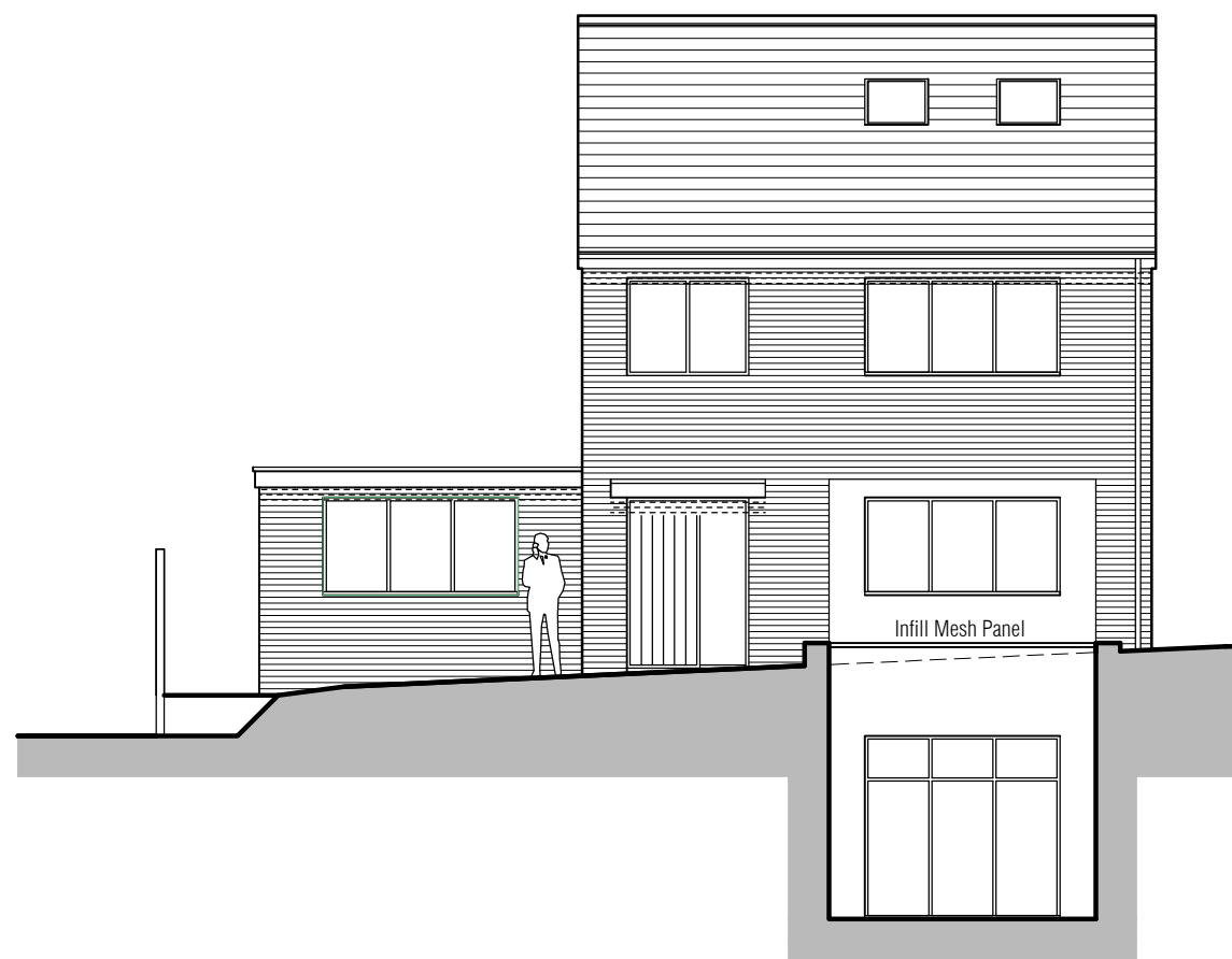
[01] Proposed Front Elevation 1:100