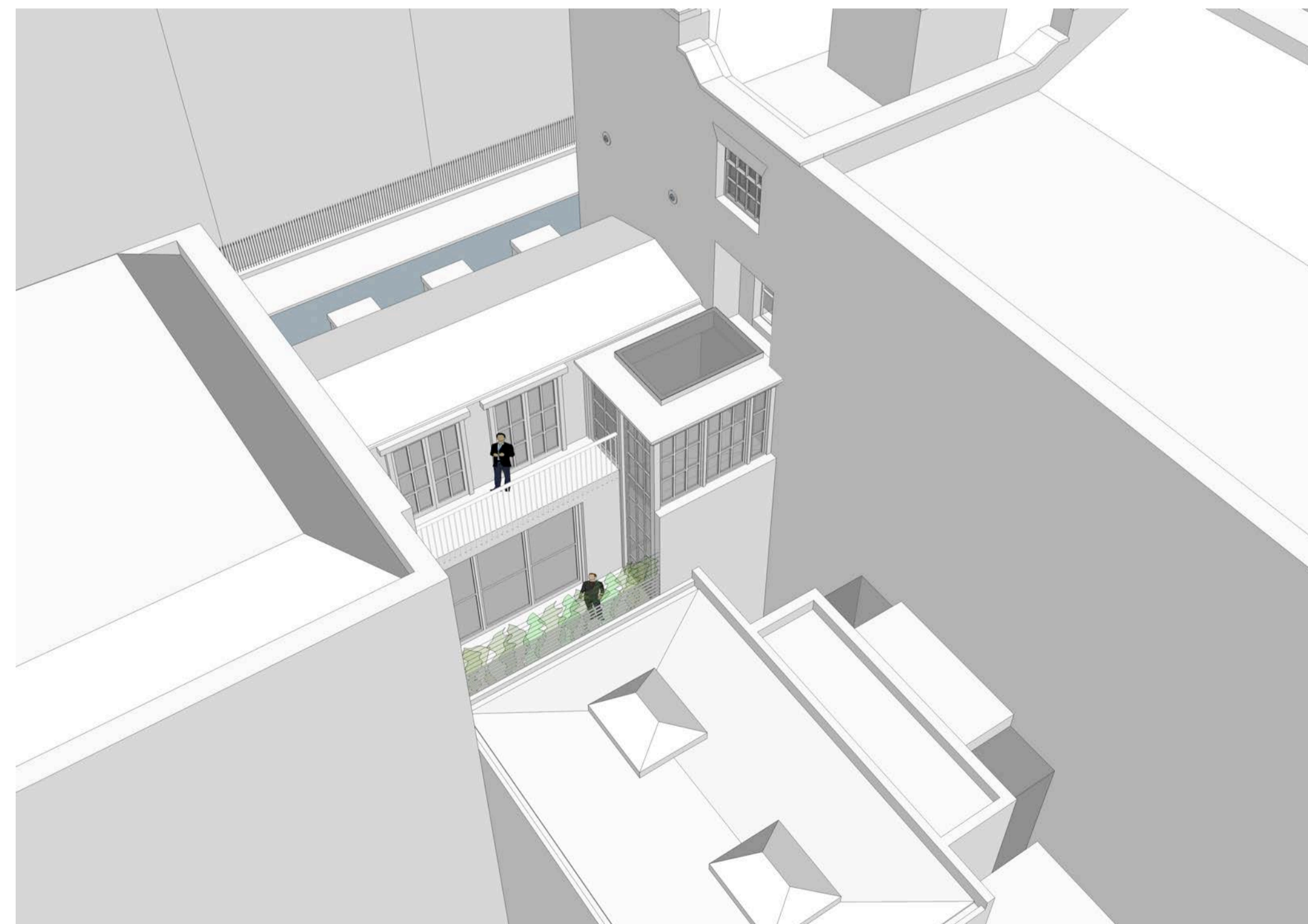
PROPOSED BUILDING MASSING MODEL