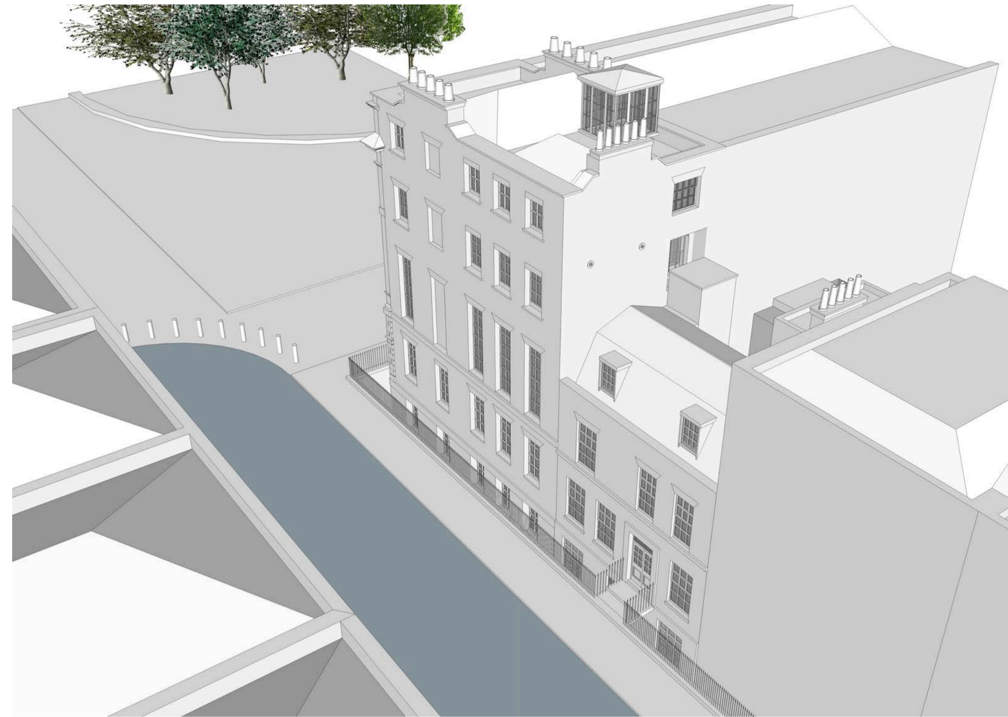
EXISTING BUILDING MASSING MODEL