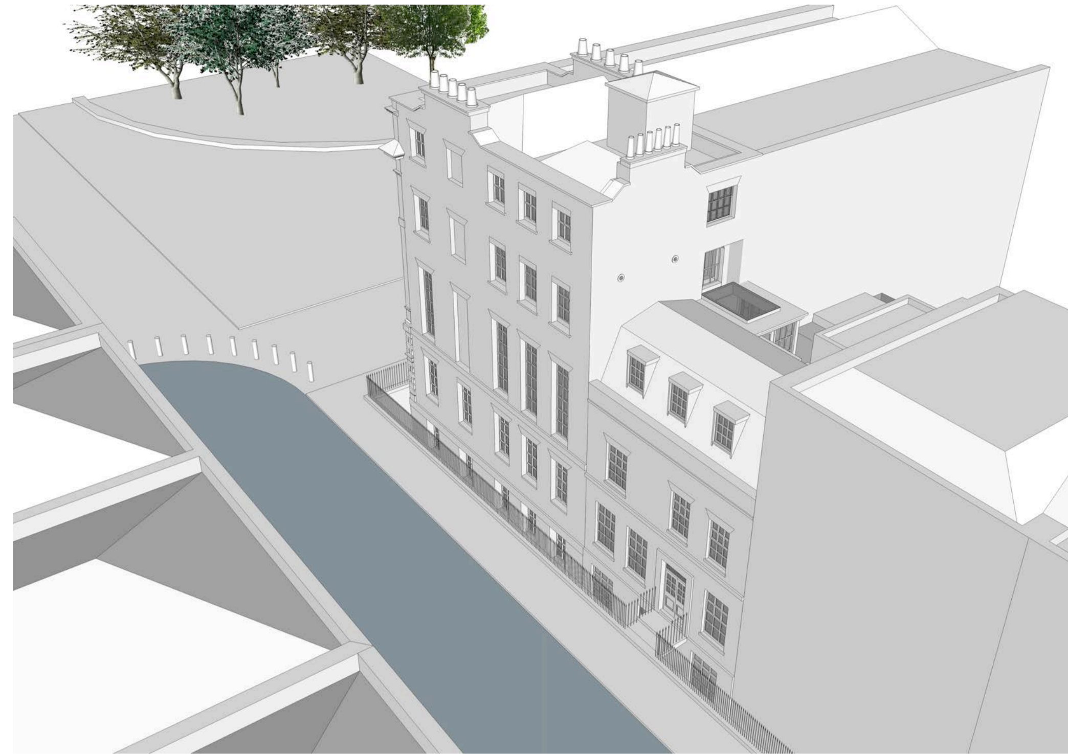
PROPOSED BUILDING MASSING MODEL